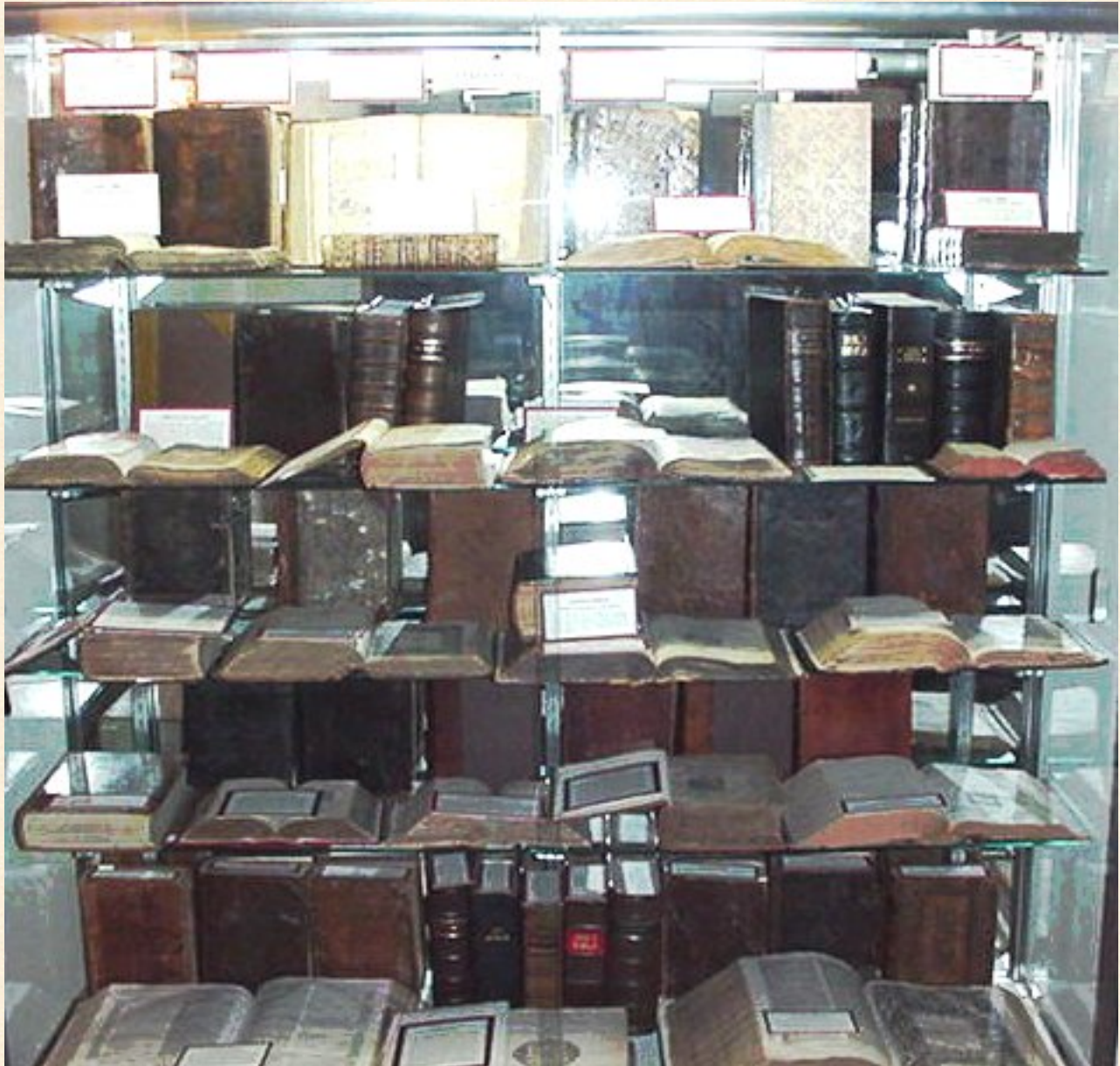
View of Station 38