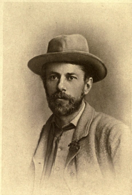
E. C., age 43. from a photograph taken in 1887.