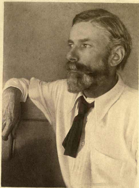
Edw. Carpenter from a photograph by F. Holland Day, in 1900.