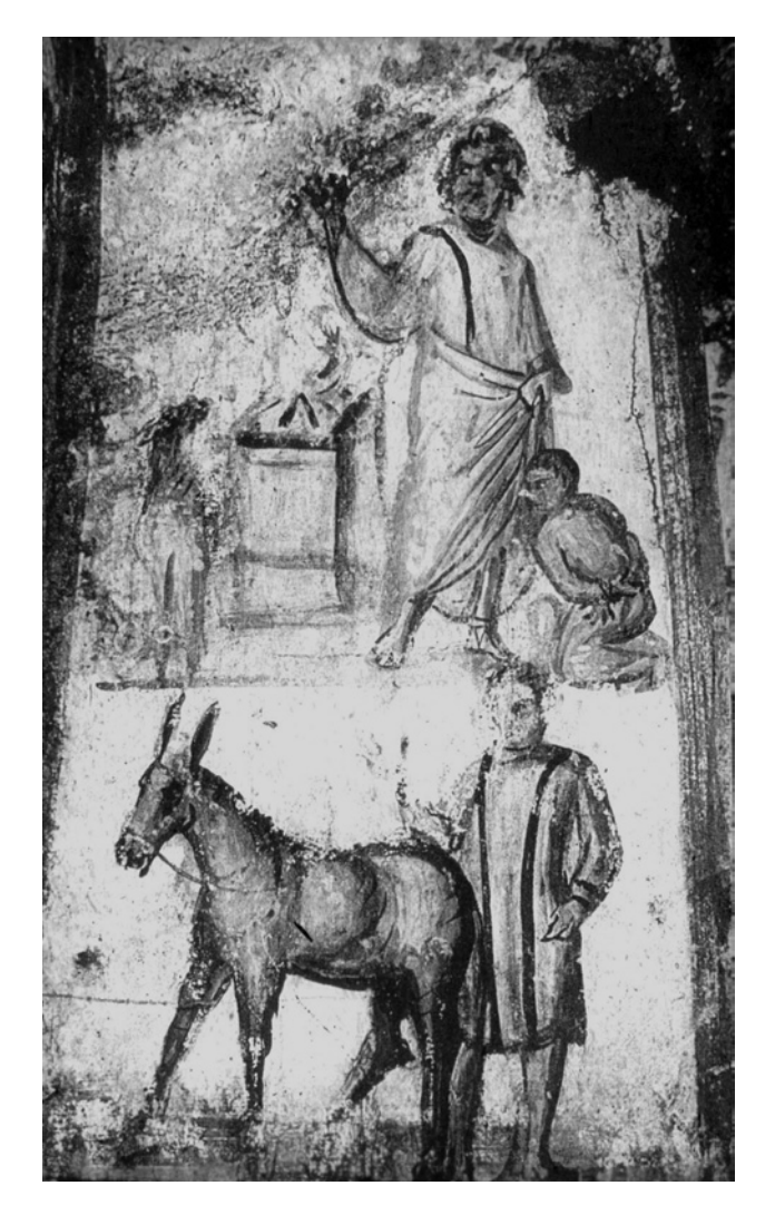
Figure 3. Cubiculum C, Via Latina (Late fourth century). Courtesy of the Hebrew University Institute of Archaeology, Slide Archive, no. 33213.