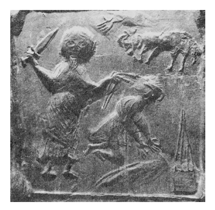
Figure 6. Terracotta tile, North Africa, sixth century CE; Musee du Bardo, Tunisia. After Gutmann, "Variations," in idem, Sacred Images , XIII, pl. 8, fig. 4.

much like the pagan-style altar of earlier representations. Other persisting features include: the fire alight on the altar, the hand of God, the tree with the tied ram. Two oddities—Isaac's seemingly suspended position and what looks like strange sort of "scarf" at his neck, seem to make this representation "of no known category."<sup>77</sup>