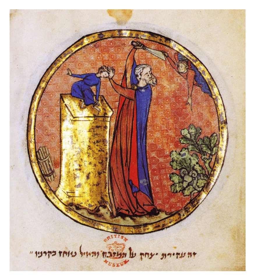
Figure 8. North French Hebrew Miscellany, f. 521v. © British Library Board (BM Add. Ms. 11639 f521v); used by permission.

the uplifted sword in the hand of Abraham. Like other miniatures in the Miscellany , this one bears compositional and iconographic resemblances to biblical scenes produced in French Christian artisan workshops, particularly those of the St. Louis Psalter (produced before 1270).<sup>89</sup>