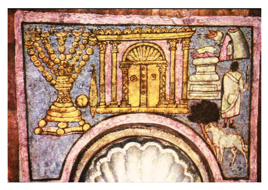
Figure 1. Dura Europos Synagogue (mid-third century), fresco above the Torah ark.

prominent in the foreground is the ram, tied to a tree. This last detail, although it would appear to contradict the biblical narrative (at least in Hebrew), emerges literarily through a reading of the various translation traditions, which gloss the sabek as "tree" ( phuton in Greek; ilana in the Aramaic targums). This detail has been read by many commentators to indicate that the emphasis in this "midrash" is entirely on Isaac's redemption; the fact that the ram is tied suggests that this redemption has been God's intention all along.<sup>61</sup> The background figure in the tent (whether Sarah or someone else) may be functioning to remind us of the original promise to Abraham (after he opens his tent to the three visitors), that it would be "through Isaac" that God would fulfill the covenant (Gen 18:10; cf. 17:21); in a sense, the image gives us a progression of three narrative moments—promise, crisis, and redemption. Thus, the Dura painting portrays Isaac as the channel of God's blessing, covenant, and promise of future redemption, linked to Torah and Temple.