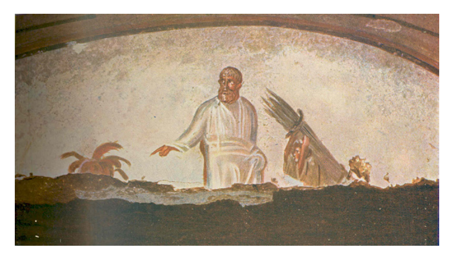
Figure 2. Arcosolium fresco from the catacomb of Priscilla (late third or early fourth century). After J. Wilpert, Die Malereien der Katakomben Roms (Freiburg im Breisgau: Herder, 1903), fig. 78.

back, which reinforces the suggestion that this is a pre-sacrifice scenario.<sup>67</sup> The parallel panel features the three young men standing in the midst of the flames with uplifted hands, while a dove with olive branch (from Noah iconography), here representing the holy spirit, flies in overhead. The juxtaposition of the two images (with an element of Noah thrown in), reinforces the notion that we are being brought into the story before the moment of deliverance has arrived.