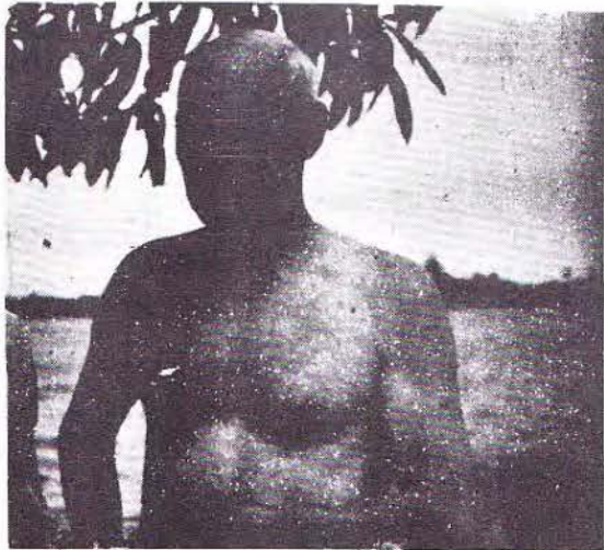
Hilton Hotema 1960