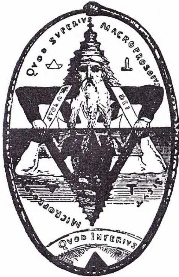
The Great Symbol of Solomon