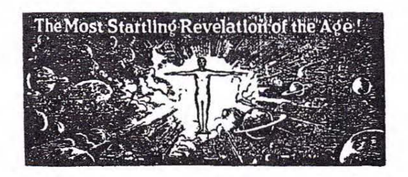
Chapter No. 15

Astral Light, in the form of lightning, pierces dark clouds and the resulting peals of crashing thunder shake the earth.