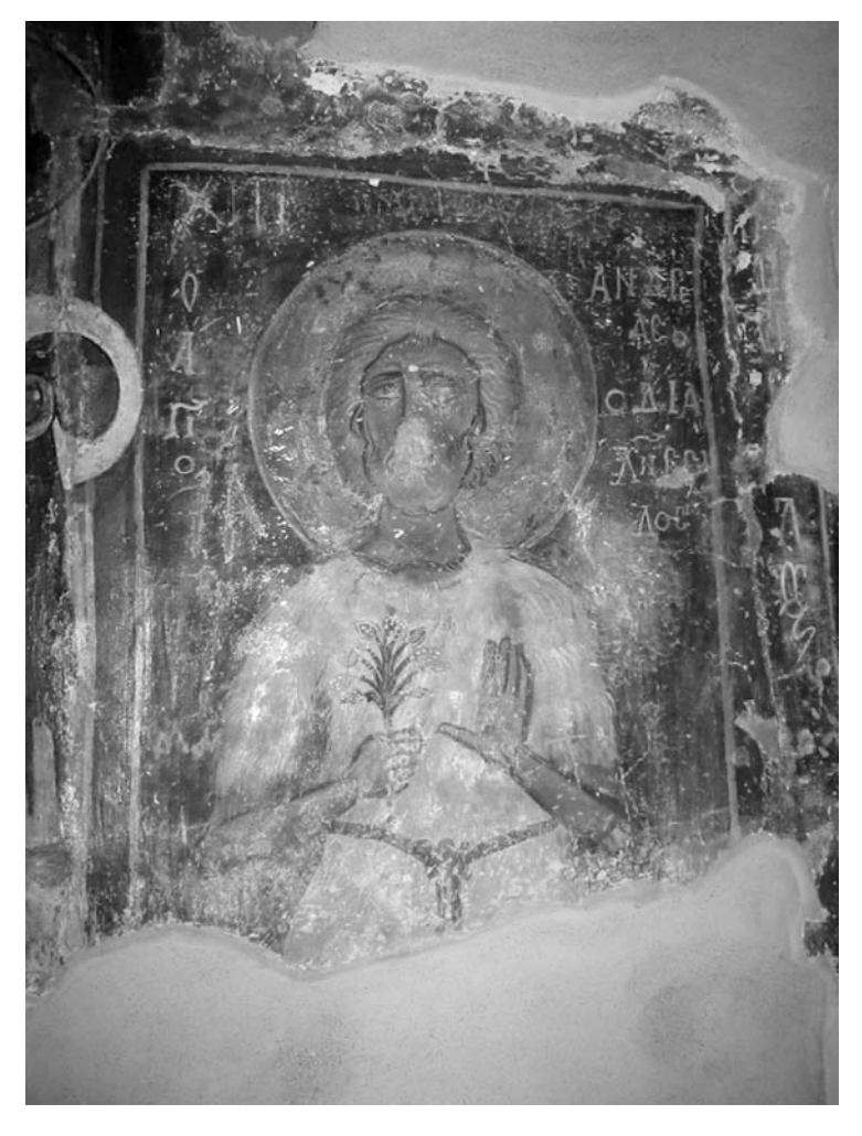
Fig. 11.1 Andrew the Fool (St Neophytos Hermitage, Cyprus, 1183). Cf. p. 202.

Nor, apparently, is the surviving text the most extreme version. There are allusions to another variant which was destroyed by the authorities because, in the reticent phrase