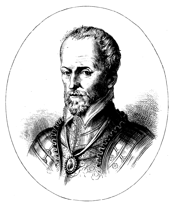
GASPARD DE COLIGNY, ADMIRAL OF FRANCE.