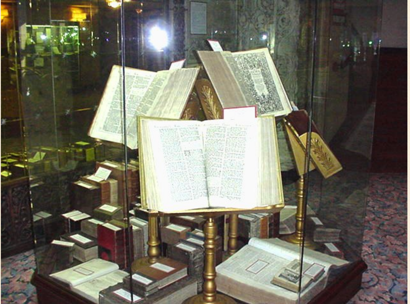
A glimpse of Station 27, showing several of the large folios from the First Edition.