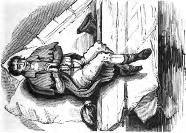
St. Bridget's Chair, in which whoever once sits, is ever after preserved from accident and sudden death.