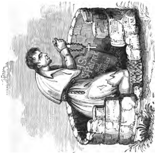
One of the seven Saints Beds in which Penance is performed.