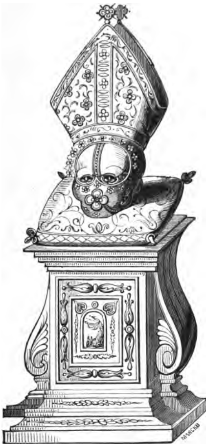
Skull of a Bishop, magnificently adorned and exposed in a Church for Worship.