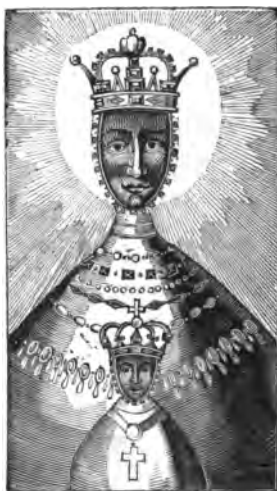
Our Lady of Anicee.