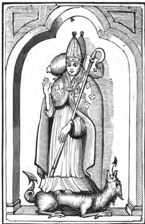
Fac simile of a Stone Monument to the memory of a Boy BISHOP, recently discovered in Salisbury Cathedral.