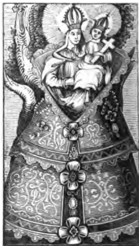
Our Lady of Corduba.