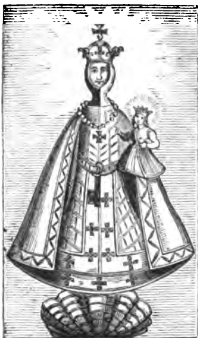
Our Lady of the Holy Fount.