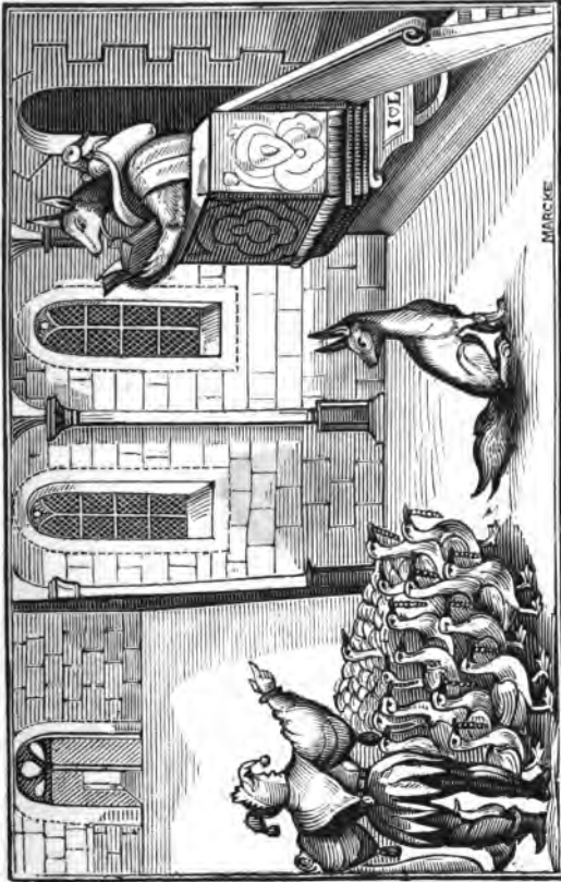
Caricature of the Preaching of the Middle Ages: from a MS. of the Thirteenth Century.