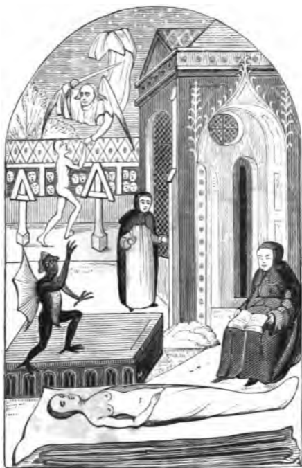
Illustration of the Power exercised by the Papal Church over the Invisible World, copied from a highly illuminated Missal of the XV. Century. (See p. 286)