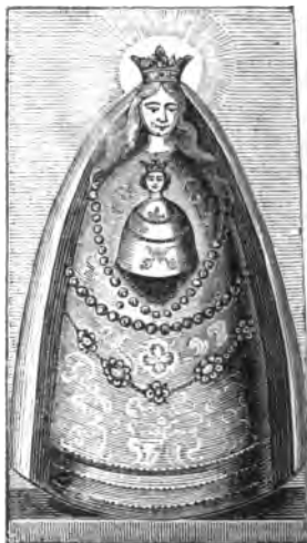
Our Lady of Tongres.