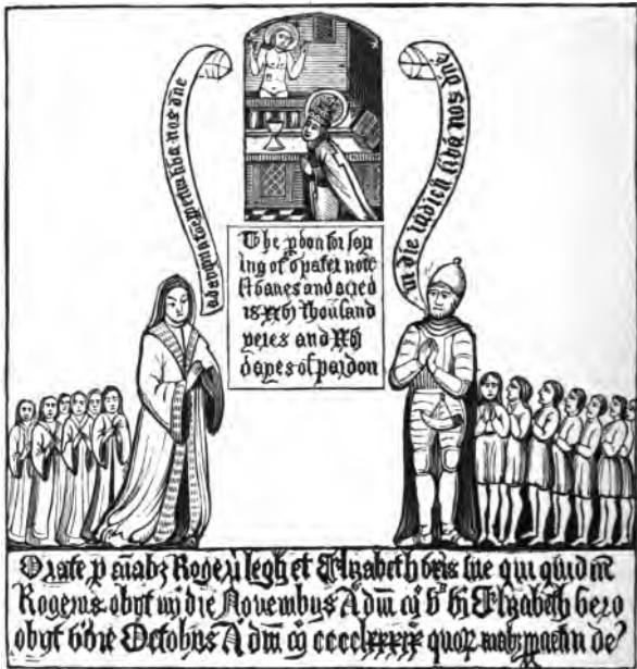
Brass Plate, in the Savage Chapel or Oratory in the Parochial Chapel of Saint Michael, Macclesfield. The Right Hand Group (which has been long removed) is supplied from a MS. in the British Museum (Harl. Coll. No. 2151).—For an account of this curious remain of Antiquity see the Protestant Guardian , No. 11. Rivingtons, London.