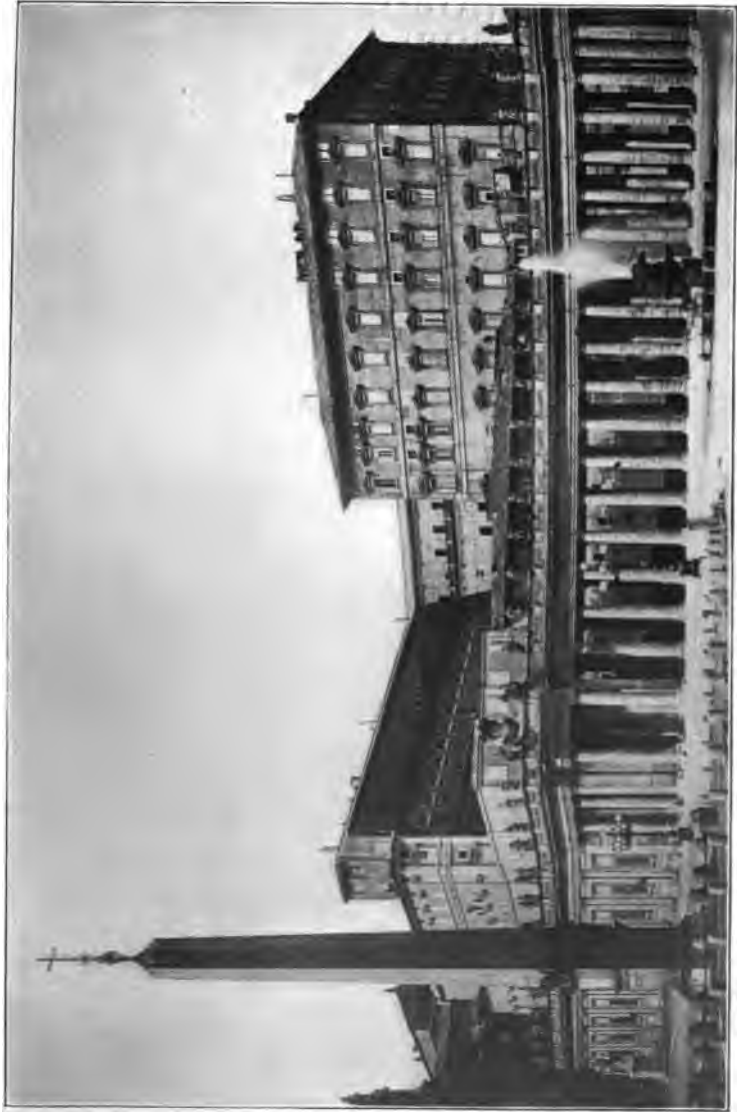
VATICAN PALACE, FROM THE PIAZZA DI SAN PIETRO