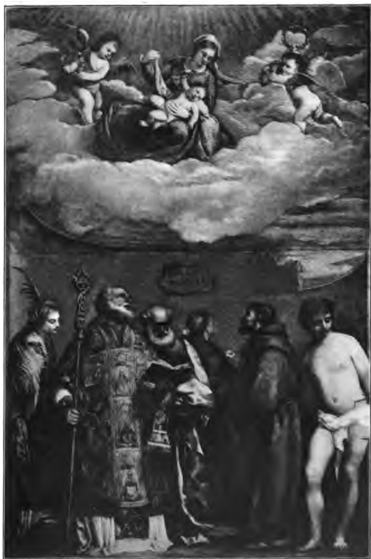
MADONNA DI FRARI By Titian; in the Pinacoteca