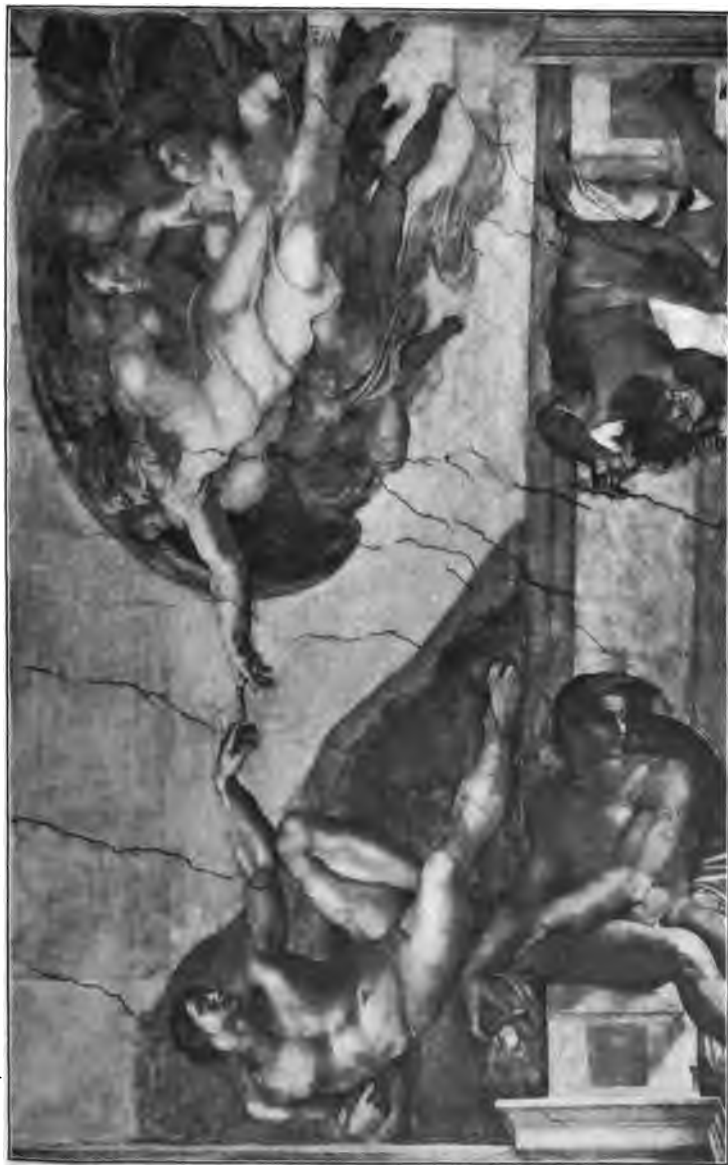
CREATION OF MAN By Michelangelo; from Sistine Ceiling