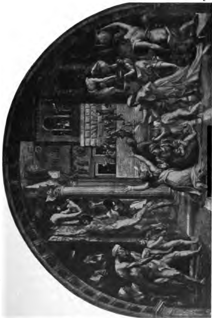
INCENDIO DEL BORGO