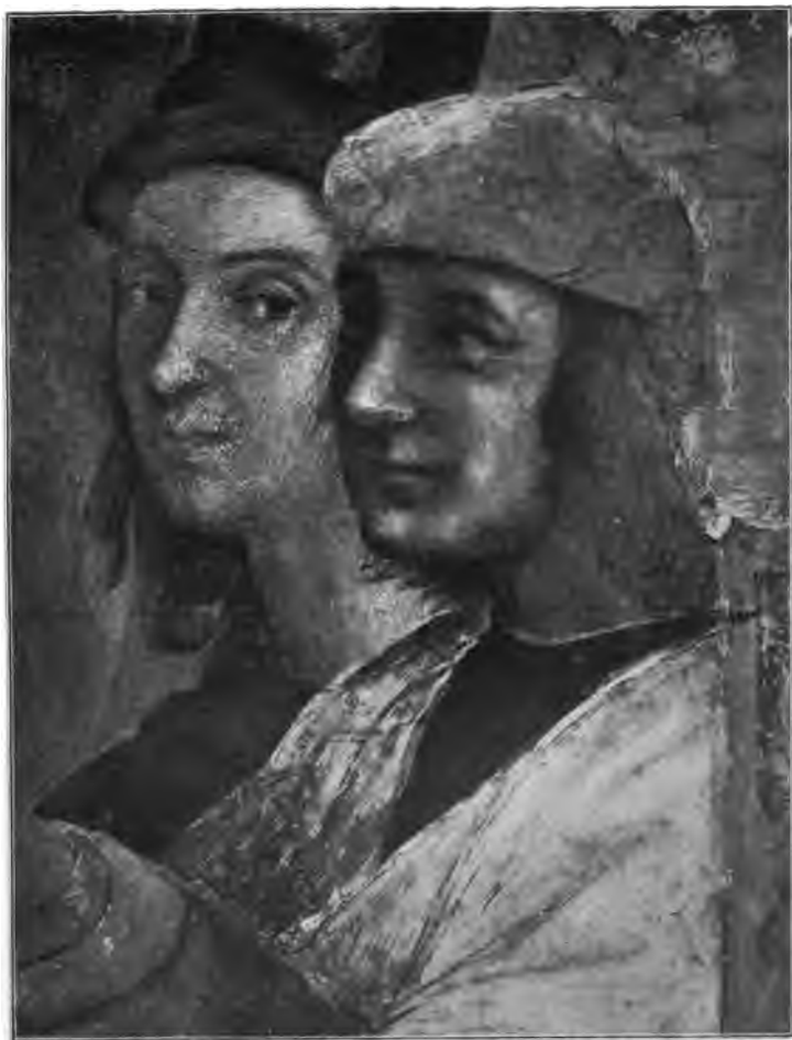
PORTRAIT OF RAPHAEL AND PERUGINO Detail from School of Athens, by Raphael; in the Stanze