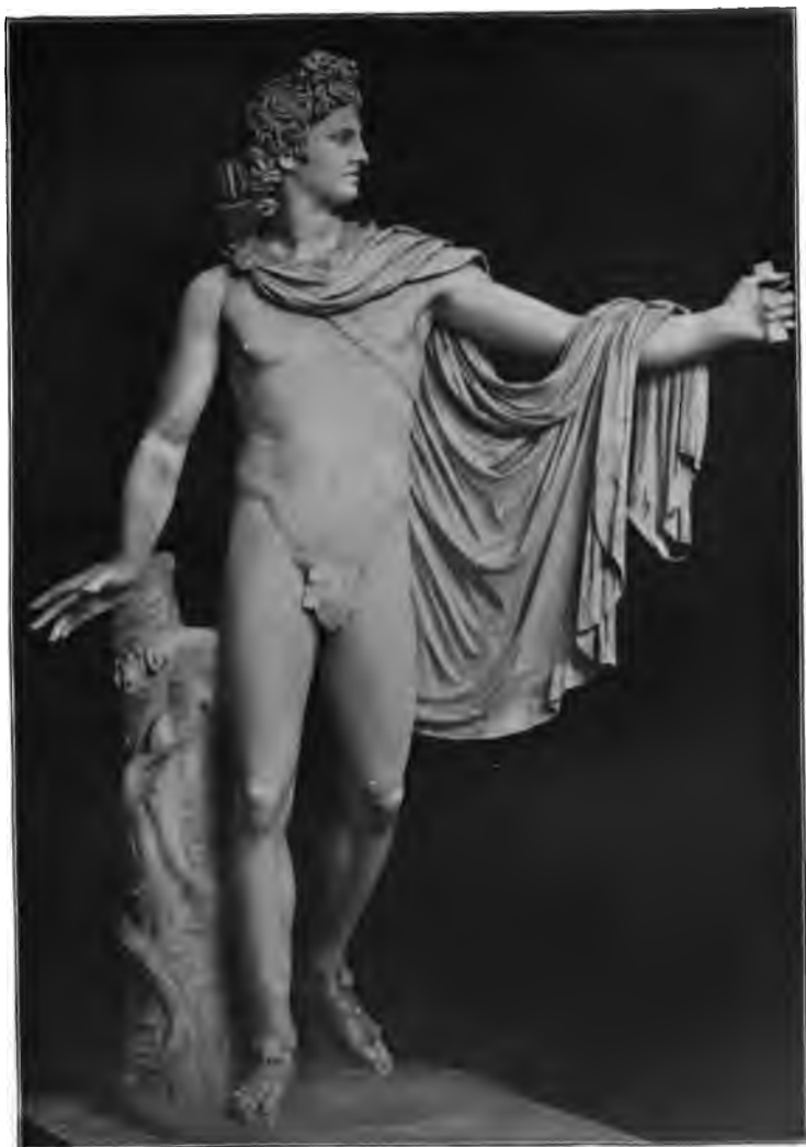
APOLLO BELVEDERE In the Cortile del Belvedere