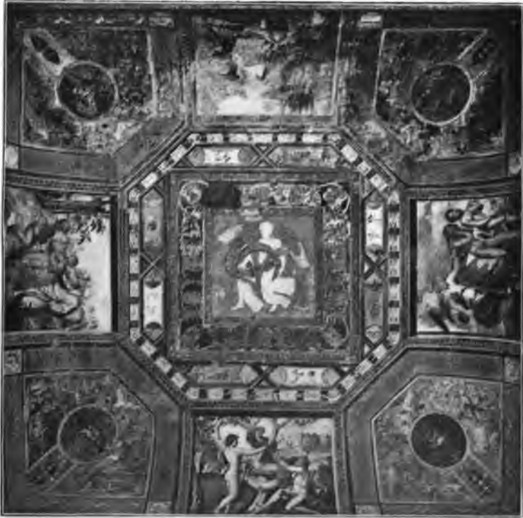
STORY OF ADAM AND EVE In Raphael's Loggie