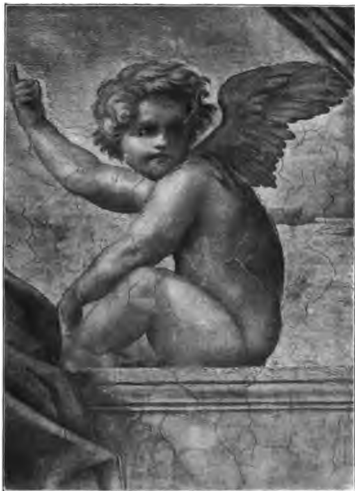
DETAIL FROM JURISPRUDENCE