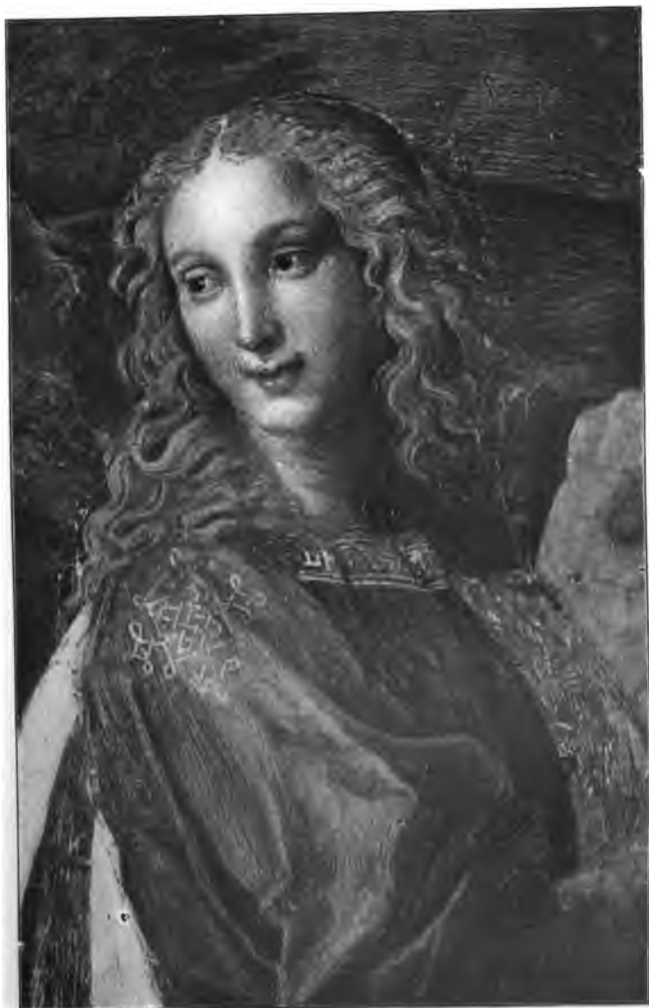
DETAIL FROM THE "DISPUTA" By Raphael ; in the Stanze