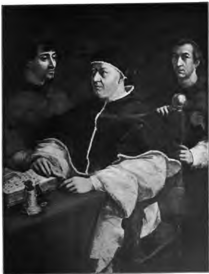
LEO X., CARDINAL GIULIO DE' MEDICI, AND DE' ROSSI By Raphael; in the Pitti Palace, Florence