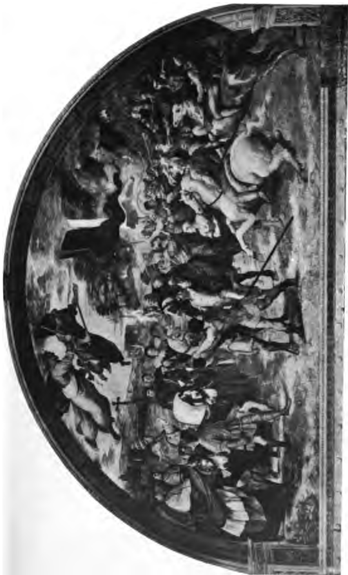
ATTILA AND LEO I. By Raphael; in the Stanze