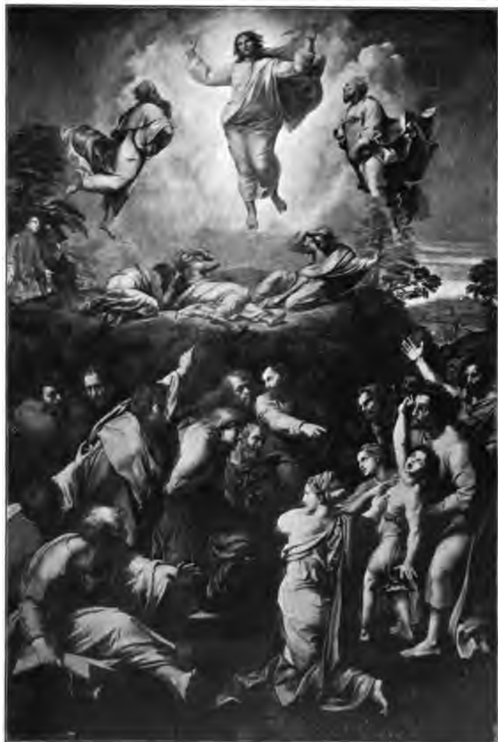
TRANSFIGURATION By Raphael; in the Pinacoteca