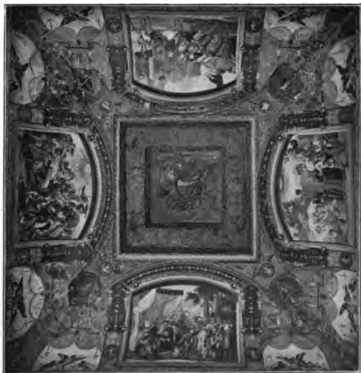
STORY OF JOSHUA In Raphael's Loggie