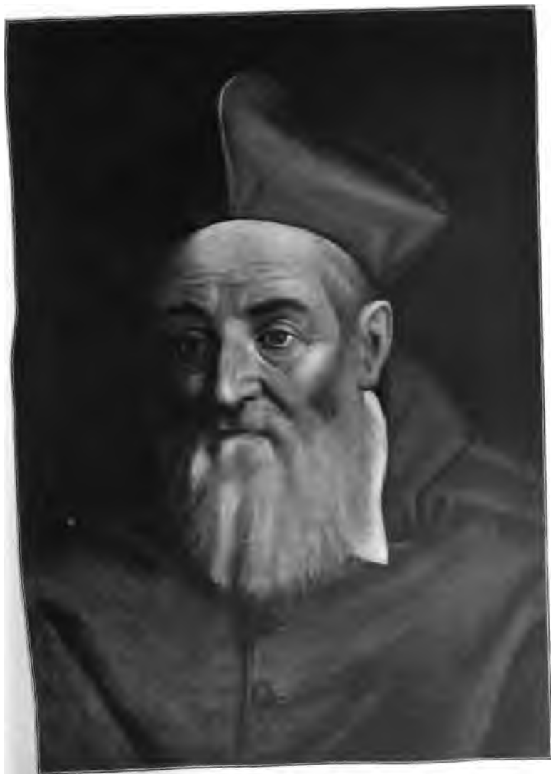
SIXTUS V. By Sassoferato