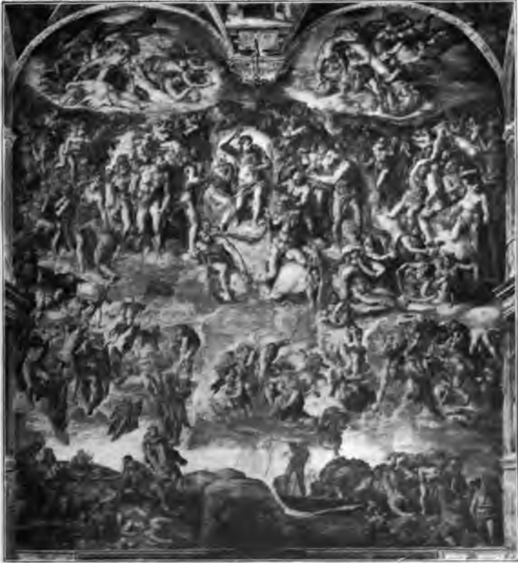
LAST JUDGMENT By Michelangelo: in Sistine Chapel