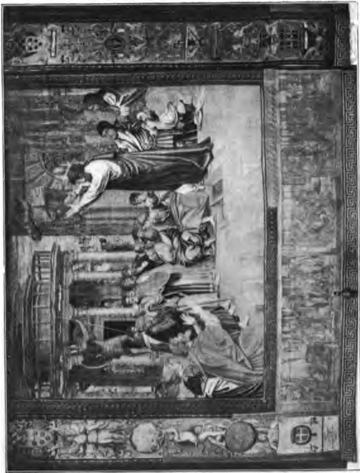
PREACHING AT ATHENS From drawing by Raphael ; in the Galleria degli Arazzi