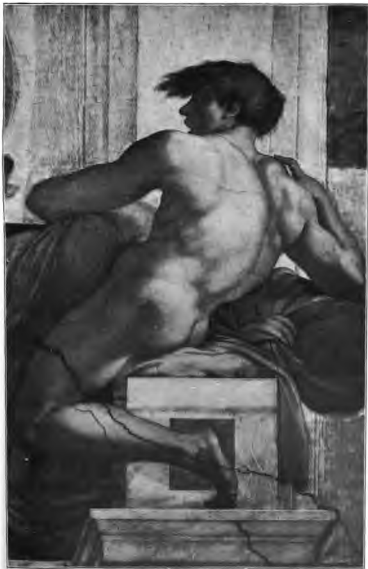
ONE OF THE "YOUNG ATHLETES" By Michelangelo ; from Sistine Ceiling