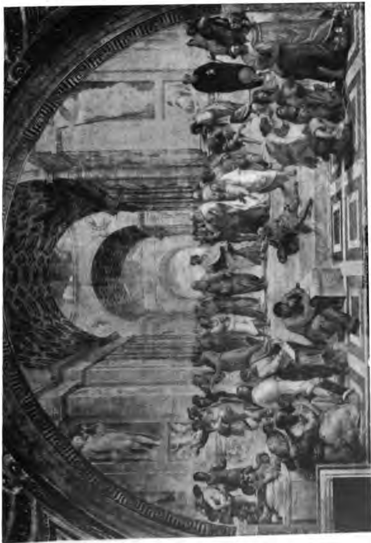
SCHOOL OF ATHENS By Raphael; in the Stanze