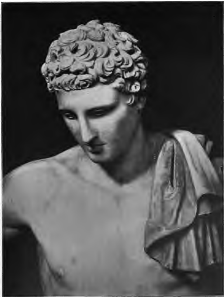
HEAD OF MERCURY In the Cortile del Belvedere