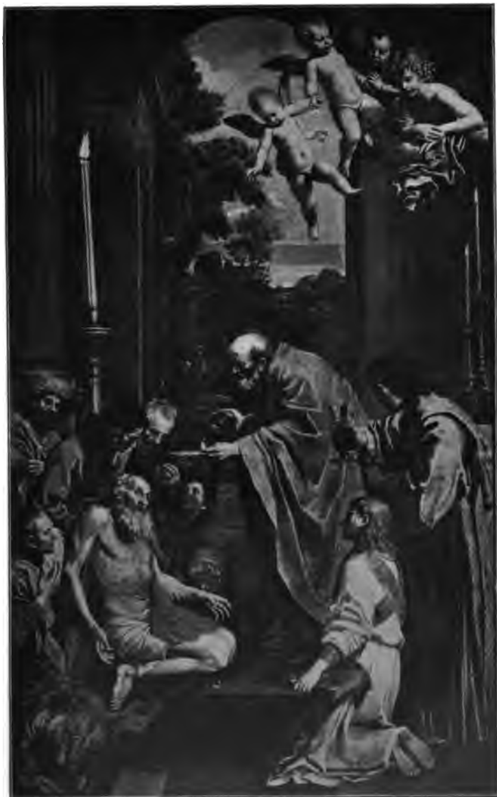
LAST COMMUNION OF ST. JEROME By Domenichino; in the Pinacoteca