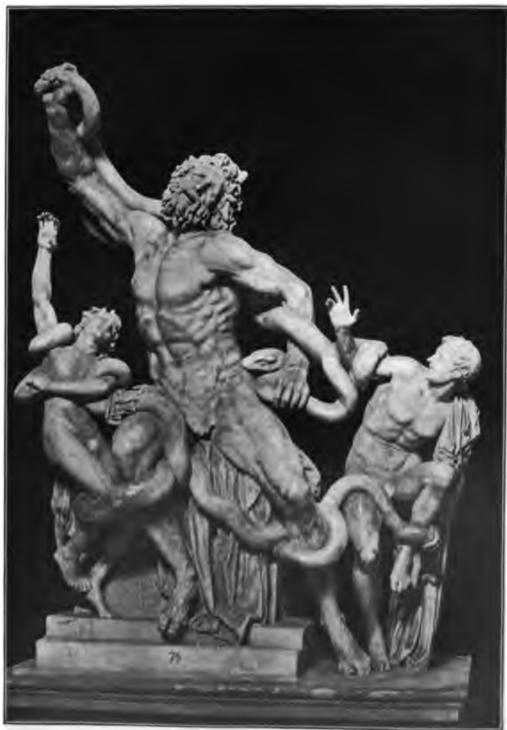
LAOCOÓN In the Cortile del Belvedere