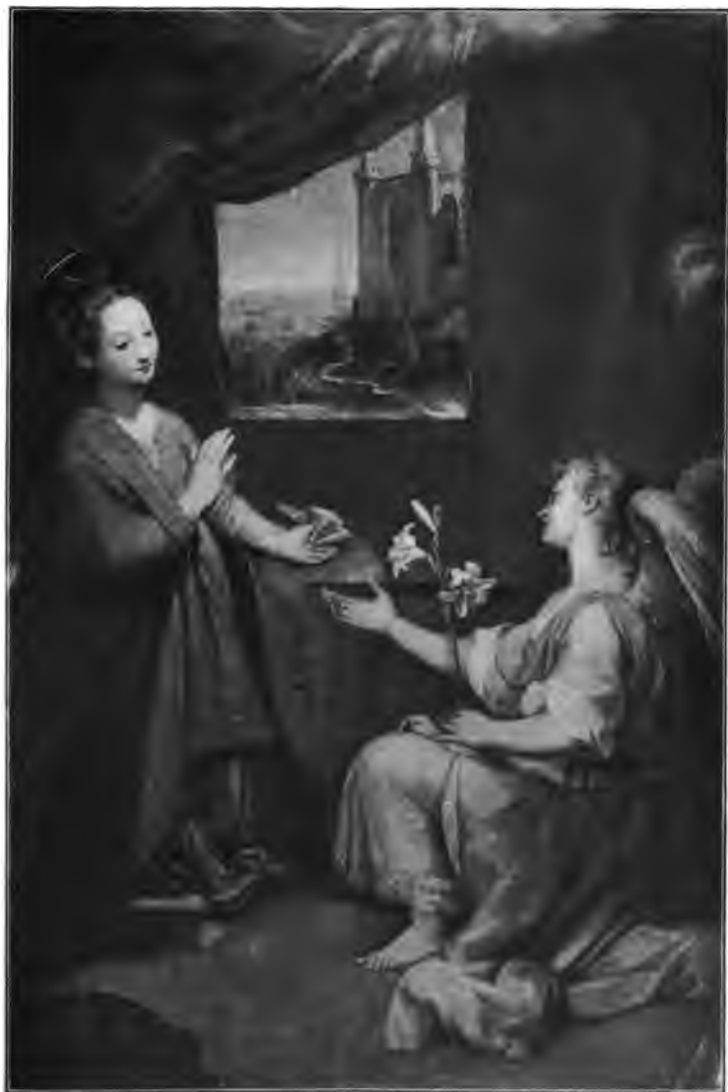
ANNUNCIATION By Baroccio; in the Pinacoteca