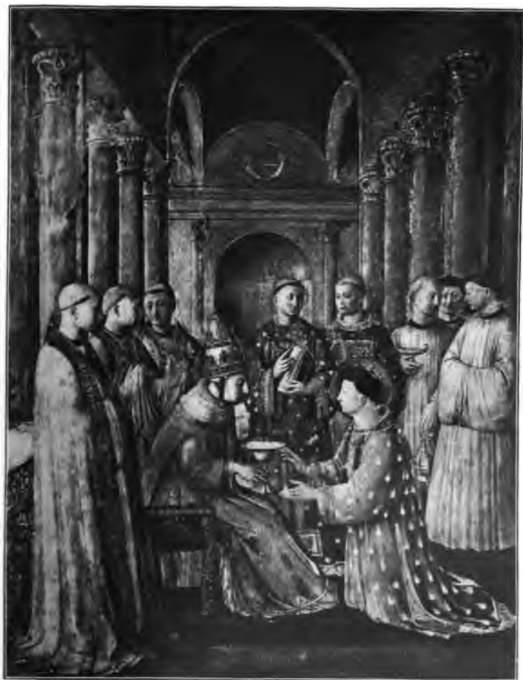
ORDINATION OF ST. LAWRENCE BY SIXTUS II. By Fra Angelico; in the Chapel of Nicholas V.