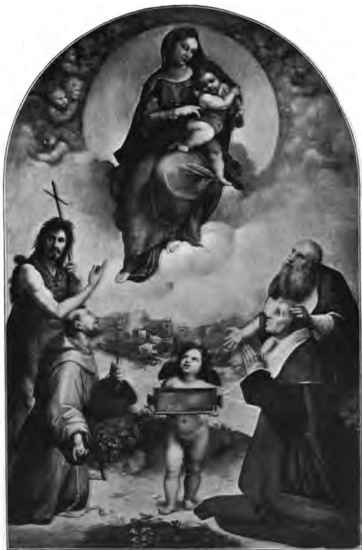
MADONNA DI FOLIGNO By Raphael; in the Pinacoteca