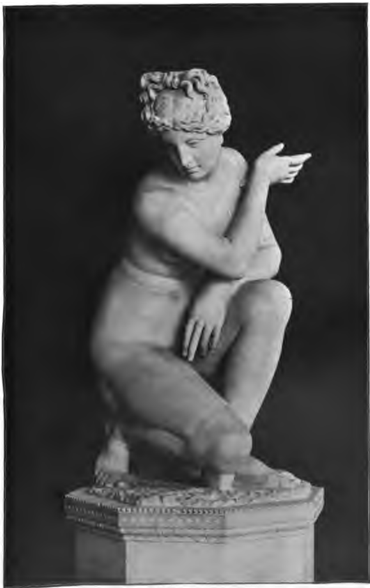
CROUCHING VENUS In the Gabinetto delle Maschere