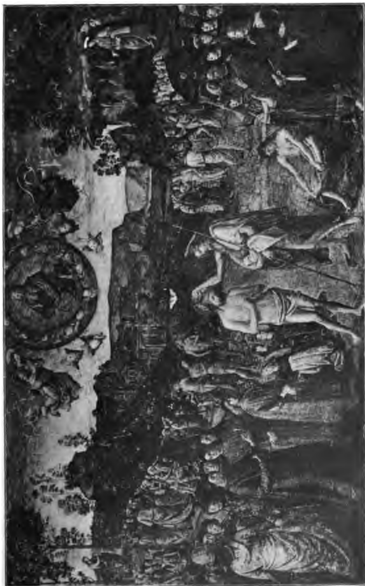
BAPTISM OF CHRIST By Pinturicchio ; in Sistine Chapel