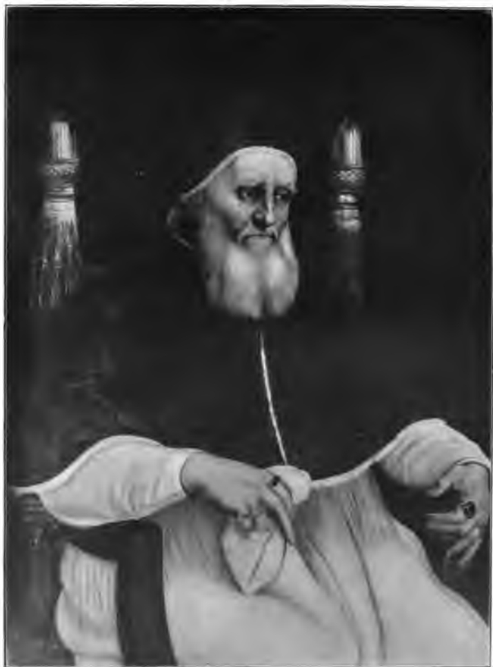
JULIUS II. By Raphael ; in the Pitti Palace, Florence