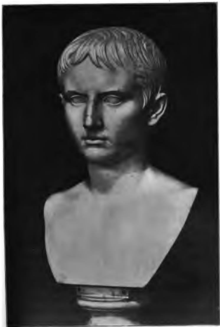
HEAD OF AUGUSTUS *In the Sala dei Busti