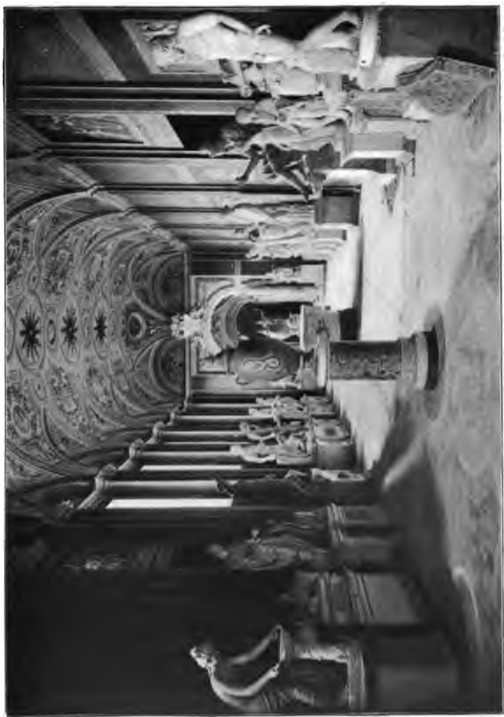
GALLERIA DELLE STATUE