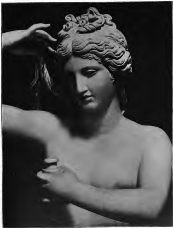
VENUS ANADYOMENE In the Gabinetto delle Maschere