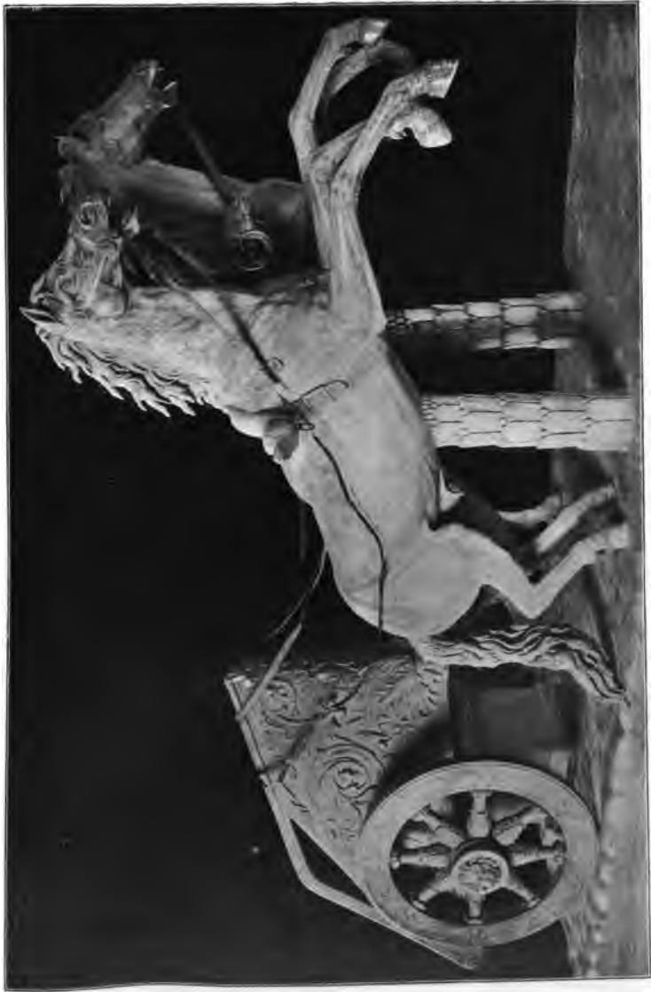
THE BIGA In the Sala della Biga