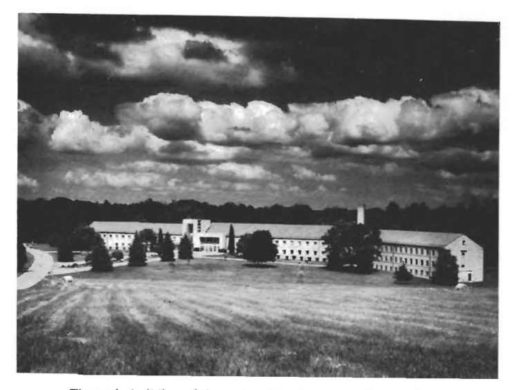
The main building of the national headquarters, Honesdale, Pa.