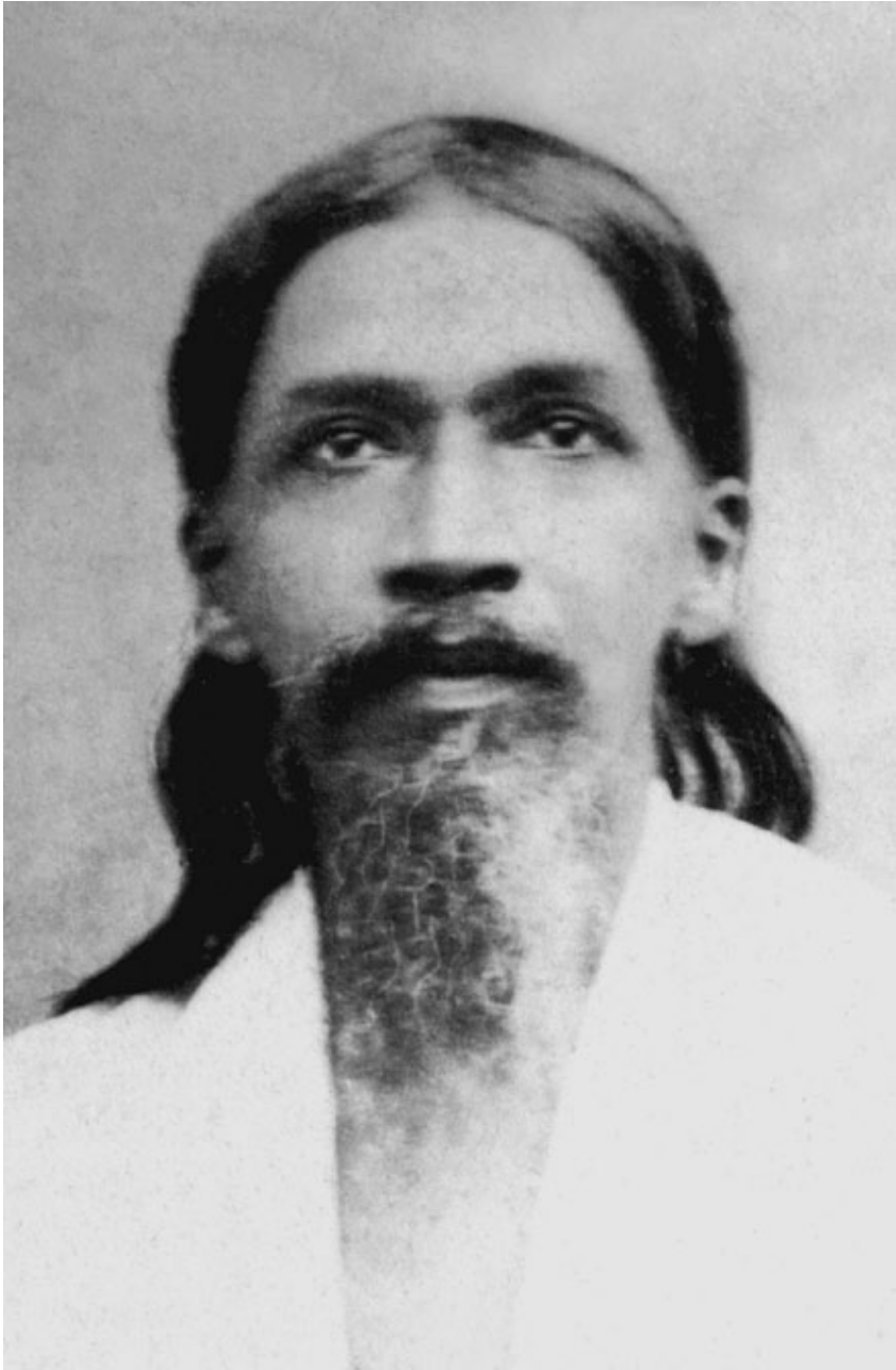
Sri Aurobindo in Pondicherry, c. 1915-1918