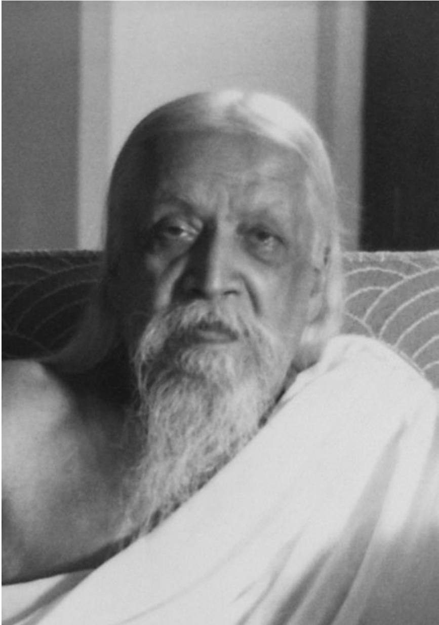
Sri Aurobindo in 1950