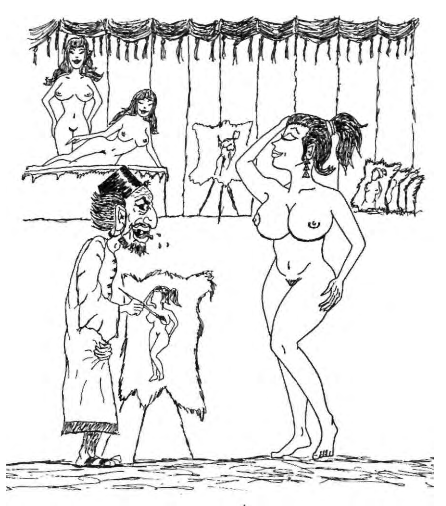
ENHANCED TRUTH'S PORN SHOP