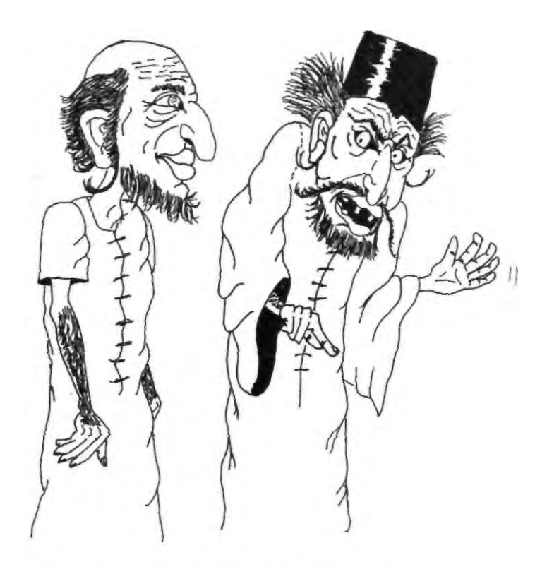
IT IS A LONG RANGE SCHEME BUT 50 IS WAR IF YOU PLAN TO WIN.

the adjoining country with a minimum use of force. Of course we could help promote the propaganda for this takeover. We would be the ruler's advisor and have an inside track to make profitable deals! If there was a war, we would not have to do any fighting for we are renowned peace lovers and are not mentally suited for fighting. We would be the merchants for supplying the army and buying the loot. As long as everyone is our friend we will have it made."