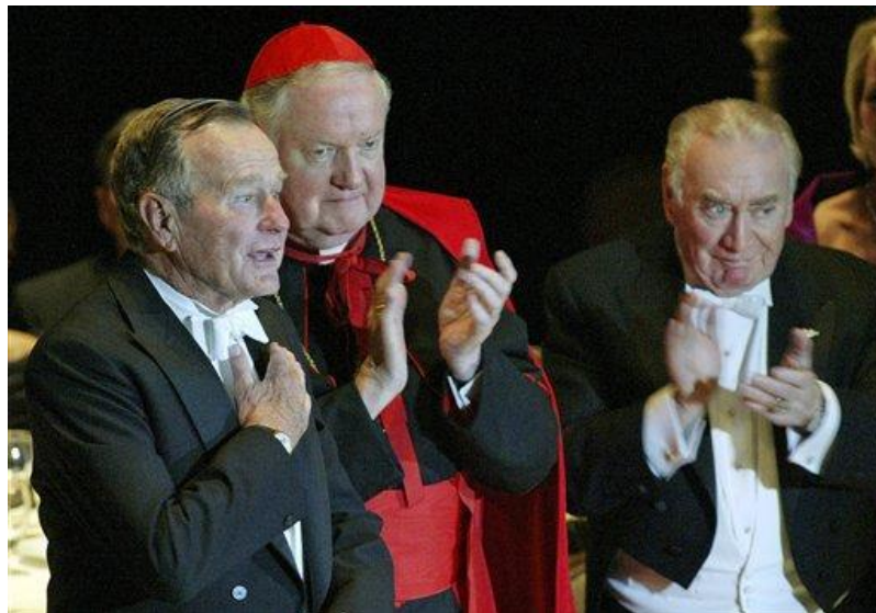
George H. W. Bush (who was the 41 st U.S. President) is meeting with Cardinal Egan.