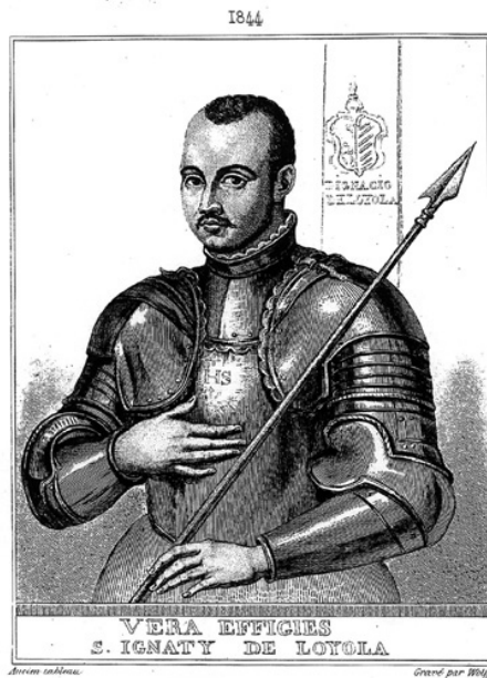
Loyola (Saint-Ignace de) Fondateur de l'ordre des Jésuites en 1564.