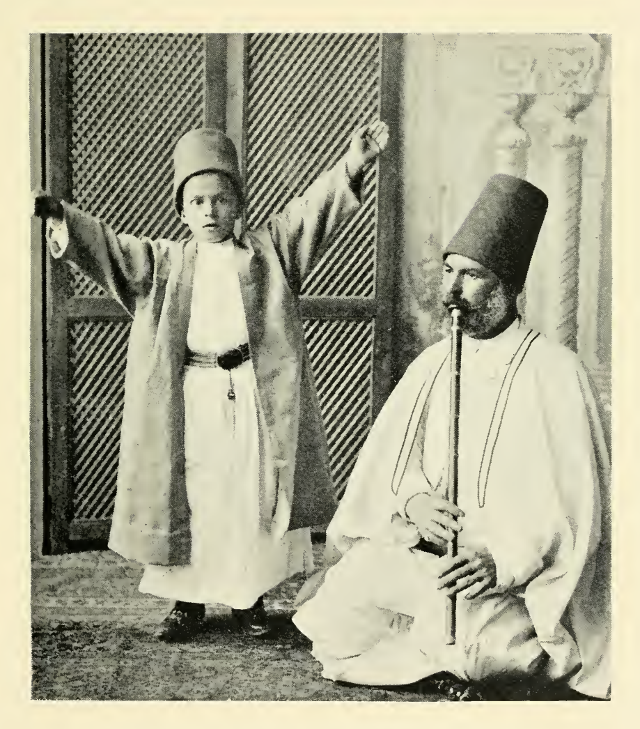
MEVLEVI NEOPHYTE LEARNING THE DEVR