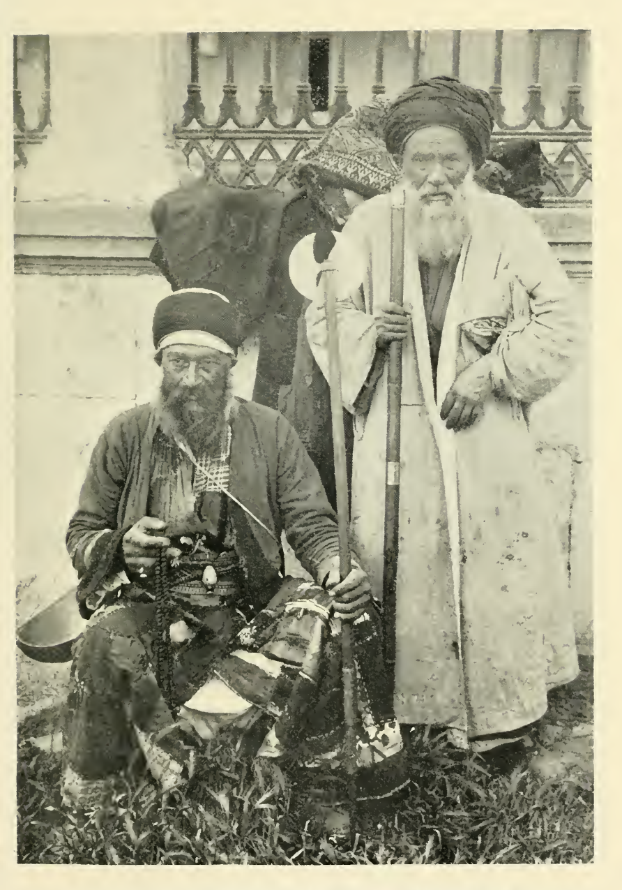
BEGGING DERVISH AND NIGHT-WATCHMAN