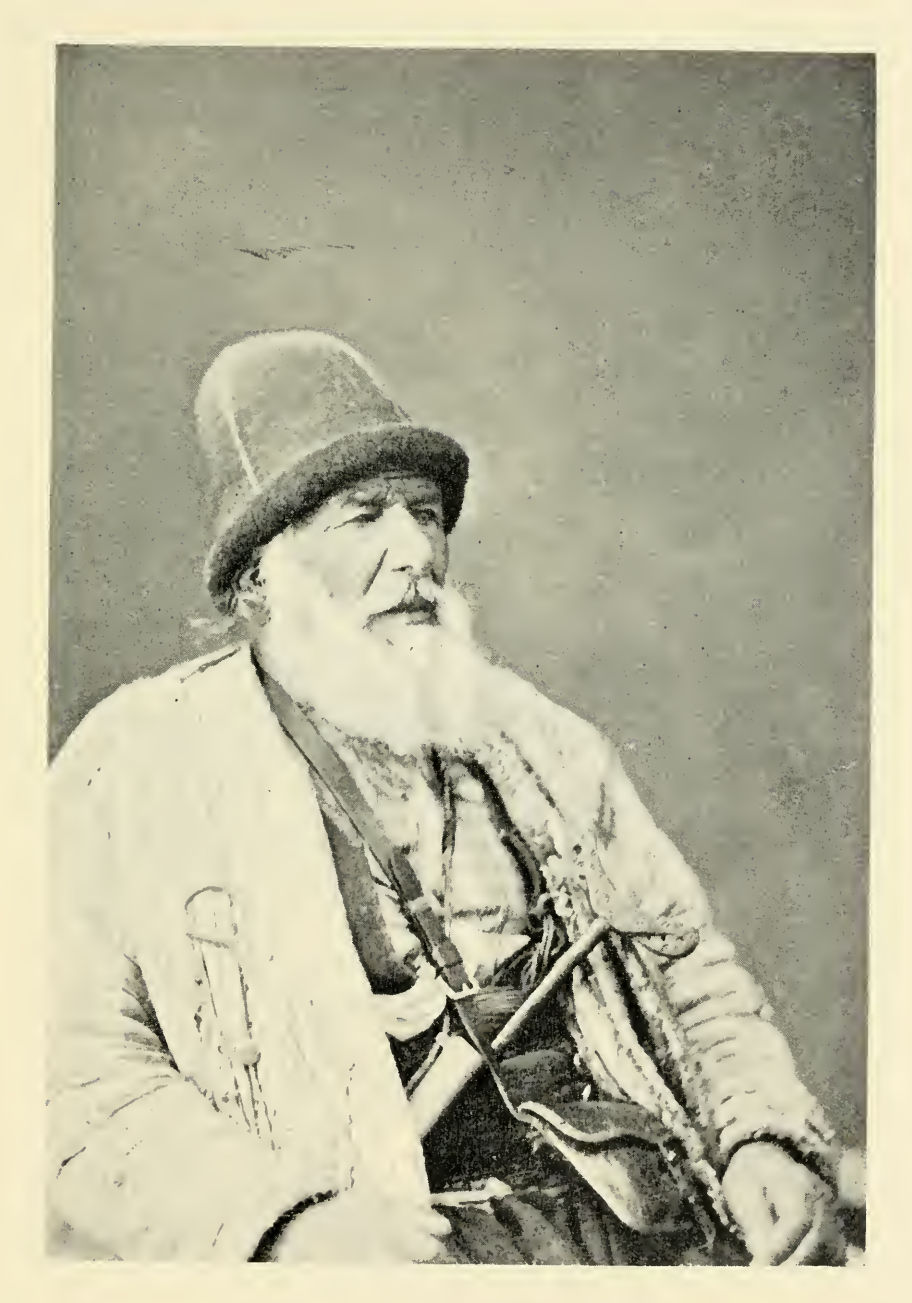
DERVISH WITH LEANING CRUTCH