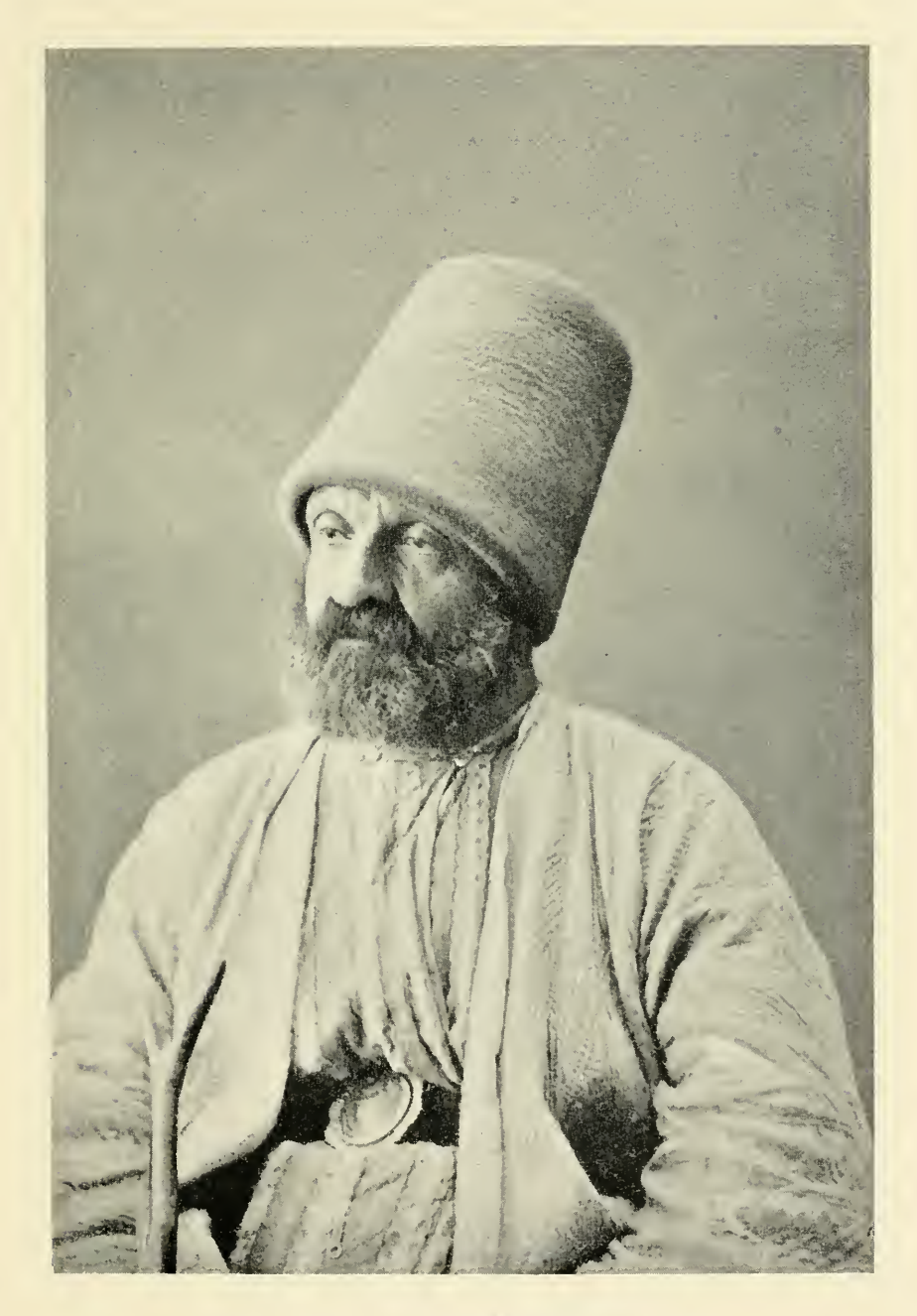
AN ELDER OF THE MEVLEVI ORDER