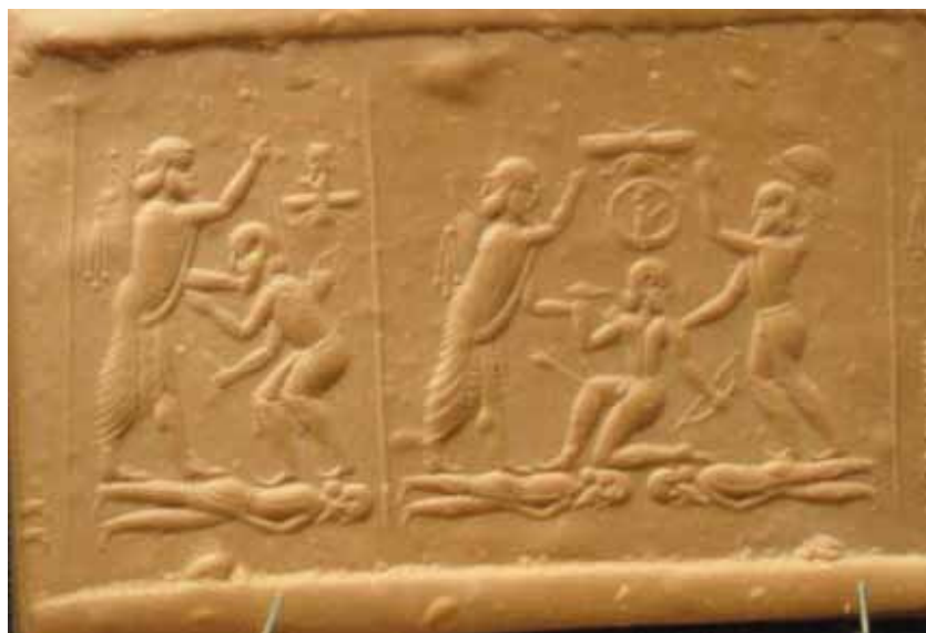
Cylinder Seal depicting War in Heaven

I?n? ?t?h?e? ?H?e?b?r?e?w? ?B?i?b?l?e? ?a?n?d? ?s?e?v?e?r?a?l? ?n?o?n?-?c?a?n?o?n?i?c?a?l? ??J?e?w?i?s?h? ?a?n?d? ?e?a?r?l?y? ?C?h?r?i?s?t?i?a?n? ?w?r?i?t?i?n?g?s?, ? ?n?e?p?h?i?l?i?m? m?e?a?n?s? ?t?h?e? ?f?a?l?l?e?n? ?[?o?n?e?s?]? ?a?r?e? ?a? ?p?e?o?p?l?e? ?c?r?e?a?t?e?d? ?b?y? ?t?h?e? ?c?r?o?s?s?-?b?r?e?e?d?i?n?g? ?o?f? ?t?h?e? ?"s?o?n?s? ?o?f? ?G?o?d?" a?n?d? ?t?h?e? ?"d?a?u?g?h?t?e?r?s? ?o?f? ?m?e?n"?.? T?h?e? ?w?o?r?d? ?n?e?p?h?i?l?i?m? ?i?s? ?l?o?o?s?e?l?y? ?t?r?a?n?s?l?a?t?e?d? ?a?s? ?g?i?a?n?t?s? ?o?r? ?t?i?t?a?n?s? ?i?n? ?s?o?m?e? ?B?i?b?l?e?s?,? ?a?n?d? ?i?s? ?l?e?f?t? ?u?n?t?r?a?n?s?l?a?t?e?d? ?i?n? ?o?t?h?e?r?s?.