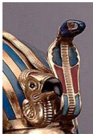
The Uraeus from Civilization.ca

- Ouroboros is a "tail eater" dragon who constantly holds its tail in its mouth. First discovered in Egypt as early as 1600 BC, Egyptians worshipped Ouroboros, as Sata, (Satan) or "Tuat", on whose back the sun god rose through the underworld each night. In Greece, it is the symbol of the universe and eternity. The serpent devouring its own tail to sustain its life is an eternal cycle of renewal, symbolising the cyclic Nature of the Universe - that creation comes forth of destruction, and life out of death. The serpent biting its tail is found in other mythological cultures as well, including Norse myth, where the serpent's name is Jormungand.