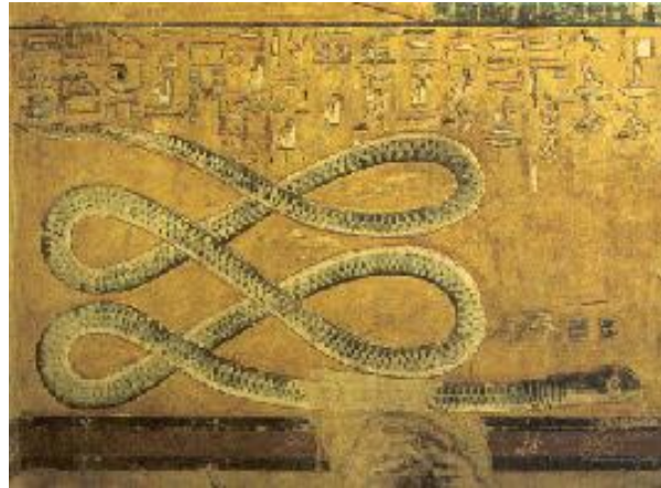
Ancient Egypt: Apep

“Aker” , was a dragon representing the Earth. It bound the coils of Apep. It was believed to preside over the point where the eastern and western horizons of the Underworld met. Aker aids the forces of light by binding and chaining the serpent when Ra passes through the underworld.