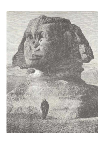
Open and Expect the results of your Sorcery through My Being!

So I say to you that to employ My Seventh Law you need be ready to Open to the Truth that All is Dream. Then select that which you believe is possible for your magical goal. Follow this with emotional Expectation that the goal shall be precipitated from the astral dreams of your heart into the vision of your eyes, the grasp of your hand, the hearing of your ear, the reality of your senses.