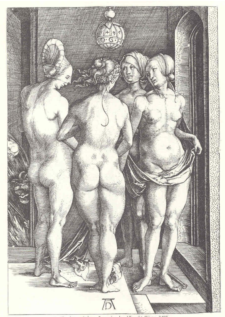
88. The four witches. Engraving by Albrecht Dürer, 1497.