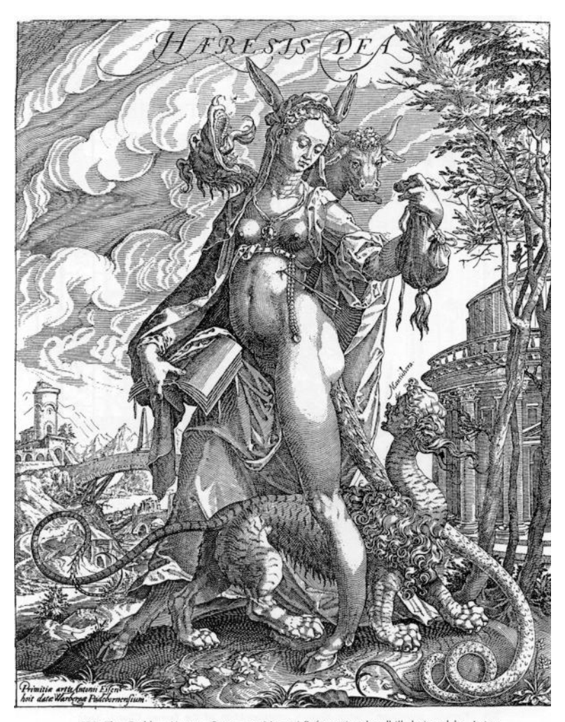
230. The Goddess Heresy. From a satiric anti-Reformation handbill designed by Anton Eisen, Paderborn, Germany, late sixteenth century.