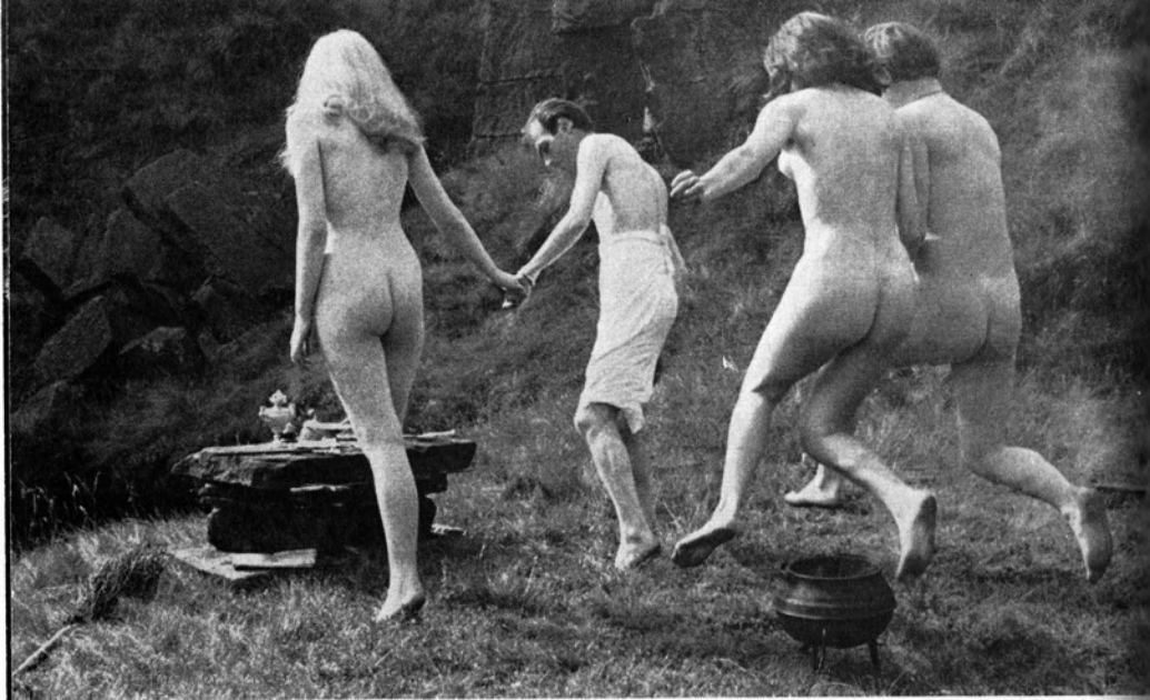
Fertility rites: the witches, in pairs, leap over the cauldron