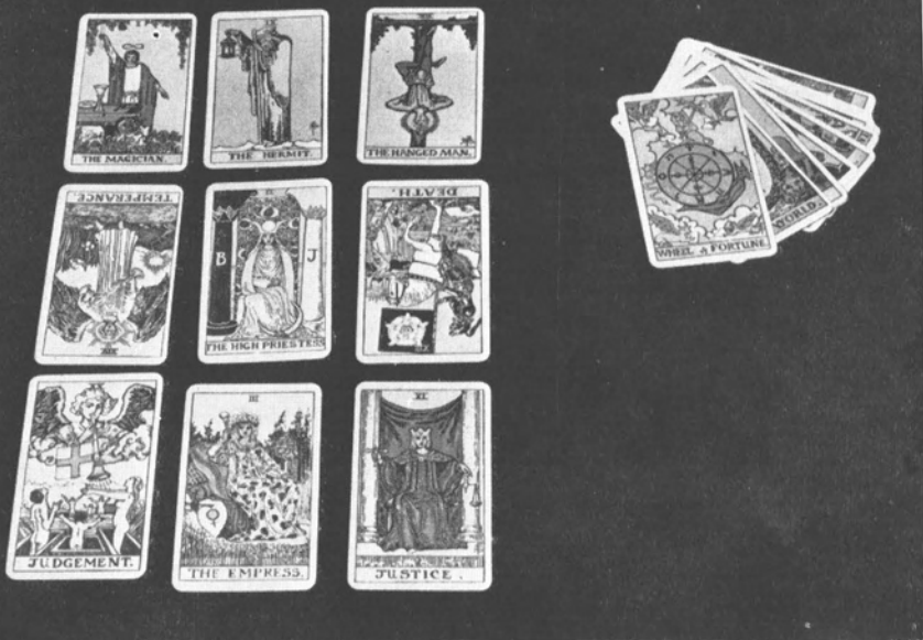
Tarot cards set out for a 'reading'

The witches' circle. The objects within it include the pentacle, athame, censer, watchtower and The Key of Solomon