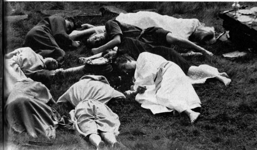
Having brought down the power, the witches fall to the ground