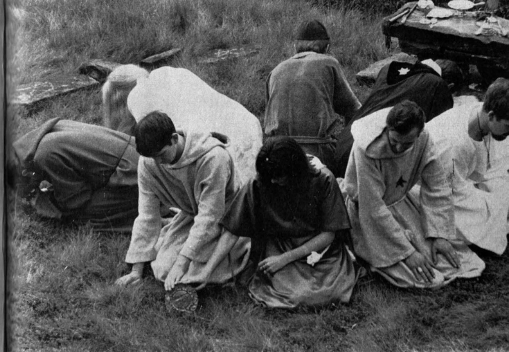
To bring money or prosperity to a petitioner, the witches pass a pentacle round the outside of the circle