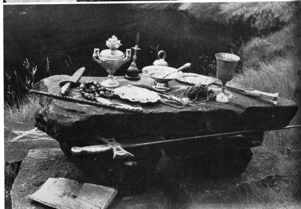
The witches' altar. Beside it lies the Book of Shadows