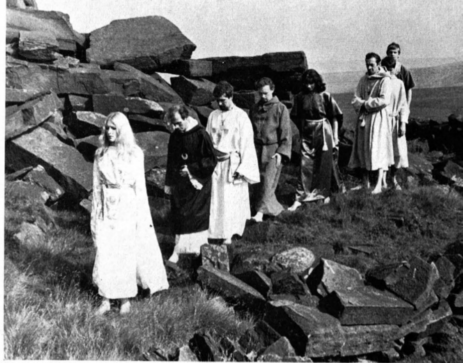
Wearing their robes, witches walk to the covenstead or witches' ring Calling down the power