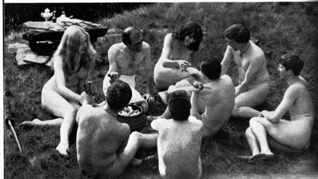
The notorious black mass—nothing more than a feast in the circle which witches believe is shared with their god

old boy from the Midlands was initiated into Alex's coven and worked diligently until he felt he was ready for the second grade. Before taking it, he had to prove that he could really draw down the power, direct it to a successful conclusion and be able to banish it. (Experienced witches say that they can see the power as a blue light that surrounds the circle.) He invited Alex to spend the week-end at his home. The evening before the initiation was to take place, they went up to the bedroom which had been prepared. In it was a single bed for Alex and a sleeping-bag for the host. The boy wanted to experiment with fire rituals and they invoked the god Set to protect them. Alex drew the circle—literally with chalk on the bare floorboards, and spiritually with his athame. The perimeter of the circle enclosed the bed but not the sleeping-bag. Then they called down the power and the boy began to light some methylated spirit, planning to pour it over himself without being burnt—as he had seen Alex do. But a few drops fell on the floor and scorched the boards. Immediately he abandoned the experiment, too afraid to continue.