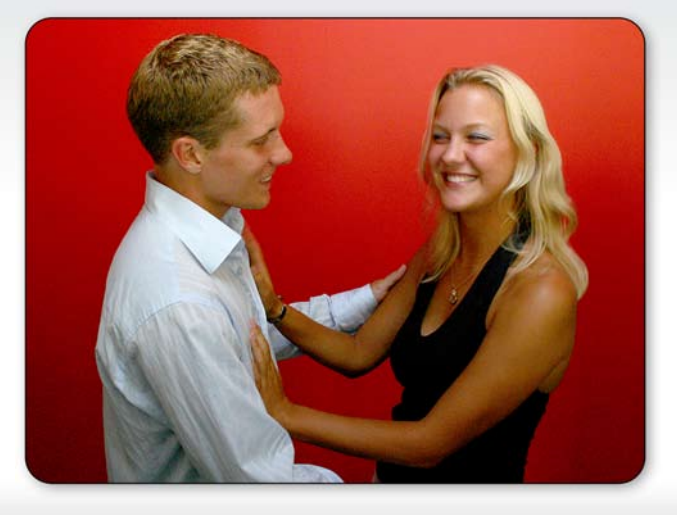
They laugh afterwards

Tip: They just need to go to another room to have some space to think about what just happened. If it was a complete surprise to them they may just need a second to get their head around it. If they return it is a good sign that they feel the same.