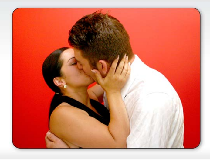
9. Repeat this one more time.