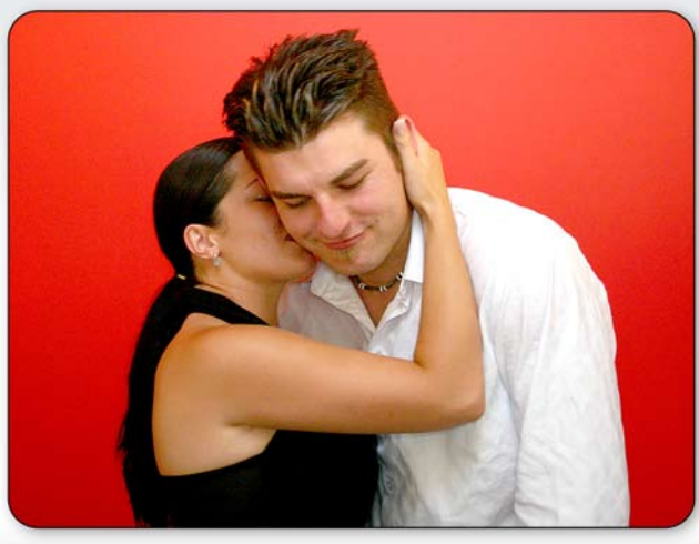
Standing slightly to the side of them gives you freedom to kiss them somewhere other than the face

Tip: May restrict movement keep it gentle. There shouldn't be any handprints.