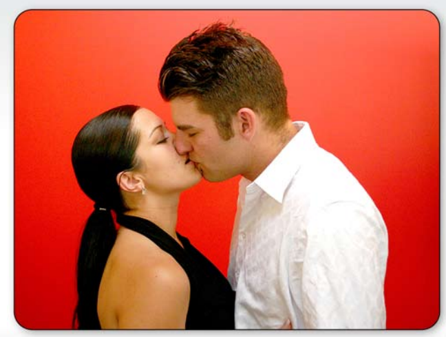
8. When your mouths are closing hold onto their lip softly as you pull away. Allow them to do the same to your lips if they try.

Tip: Suck in a little bit while doing this. While closing your mouth by sucking in a little it pulls theirs lips into yours. Don't try to vacuum their tonsils out though.