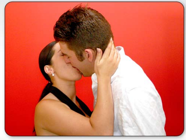
13. Once you have been doing step 12 for a while you can experiment more with your tongue being a little more vigorous.