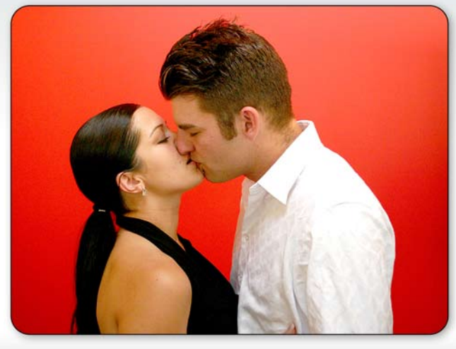
6. Make contact with their lips and mouth.

Tip: If this is the first time you have French kissed someone then you may want to leave you eyes open for a while yet. Don't be afraid to look to make sure you are getting the right spot.