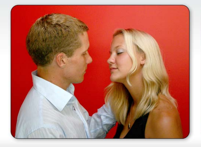
9. Pull away slightly with your hand still behind their head pull them in again.

Tips: By pulling away a little keeps you in control. Also you can make sure the other person definitely feels comfortable in the situation.