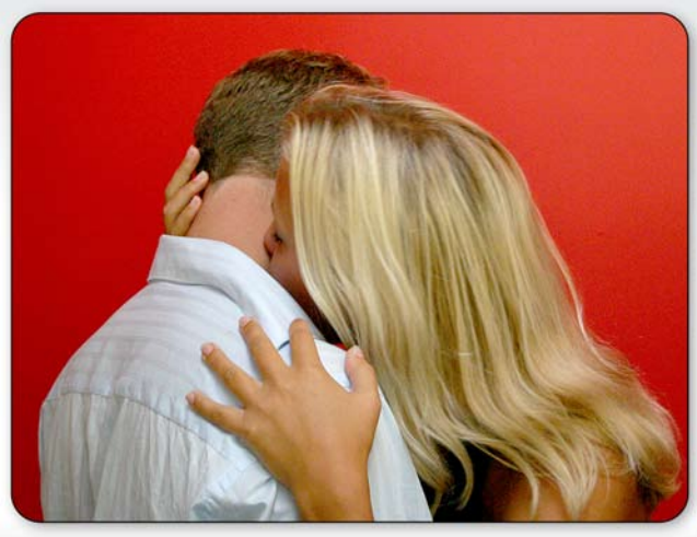
Kiss your partner along the collar bone. Mix baby kisses with a soft rubbing motion of the lips on their skin.

Tip: Don't be to slobbery it may turn from sexy to uncomfortable.