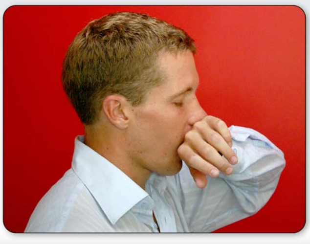
6. Practice the steps for French kissing as well. It is obviously hard to get exactly the same practice with your tongue but you will get the idea.

Tip: Once your eyes are closed you will be amazed by how kissing will come naturally. You go with what you feel.