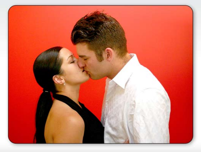
15. Start kissing without any tongue.