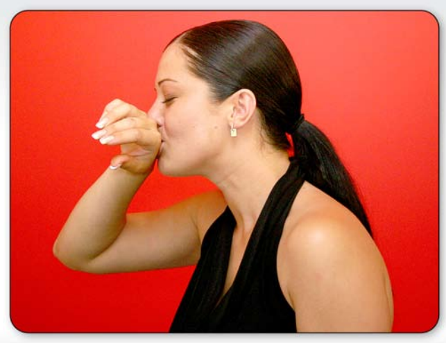
4. Continue on using the steps from first kiss section.