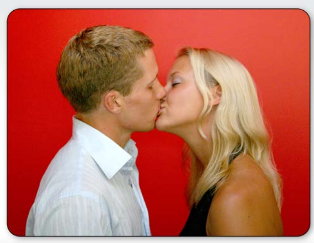
8. Do the same again but this time kiss the opposite lip to the time before.

Tips: Don't let go then pull back. Let go as you are pulling back, keeps the flow more this way.