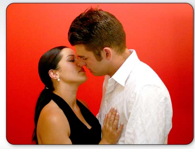
16. Then finish off just how you would a normal kiss.