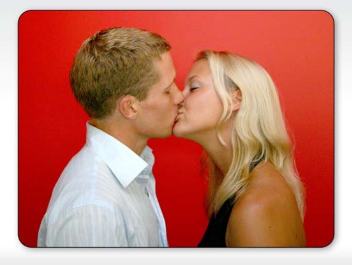
5. Kiss either top or bottom lip so lips intertwine.