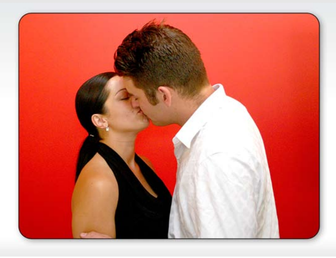
1. Start off by following the First Kiss steps to warm up for the French Kiss.

Tip: You need to keep the kisses flowing when you go from a kiss to a French Kiss.