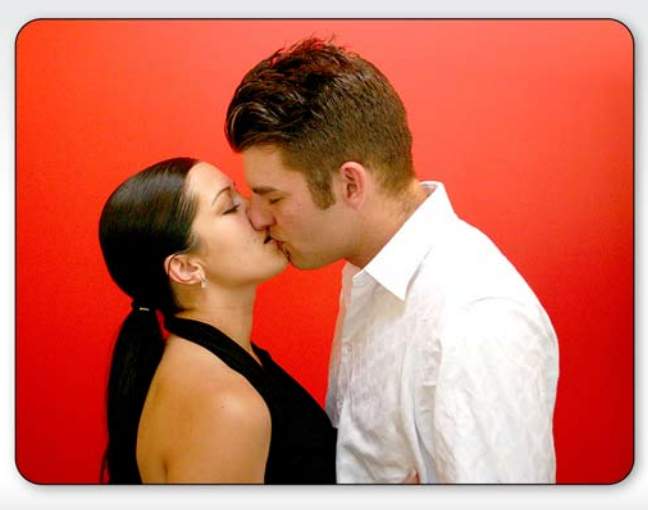
10. Repeat steps 5 & 6 again.