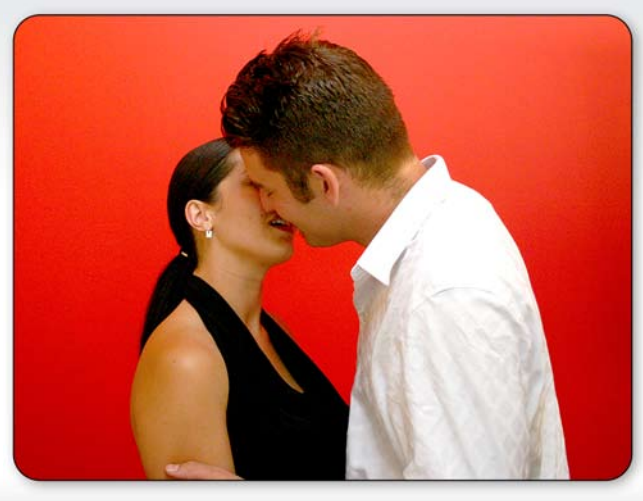
2. With you head slightly tilted to the side

Tip: You need to keep the kisses flowing when you go from a kiss to a French Kiss.