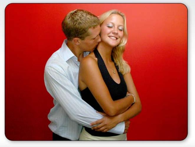
Put your arms around their waist from behind. Makes them feel comfortable in your arms.

Tip: Don't stop a kiss then move then kiss again just so you can kiss the neck. Keep it flowing.