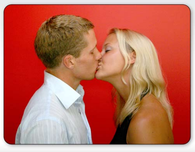
6. Hold here for a couple of seconds.

Tips: When holding this step think nice soft kisses. Apply a little bit of pressure so you can feel it. Don't bite their lips off, but there needs to be enough so it feels like there is nothing there.