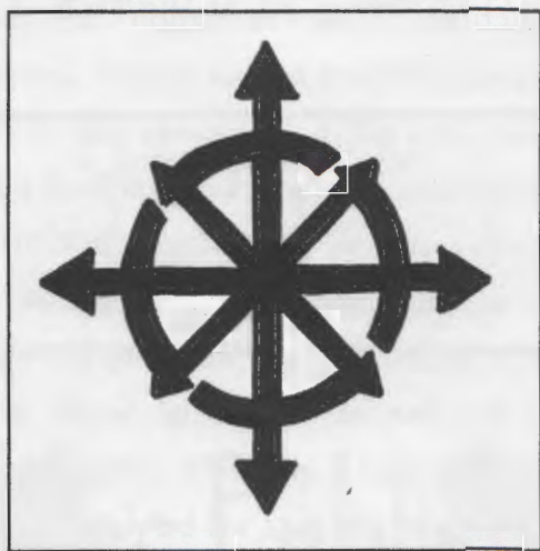
Sigil of the P'hansigar III°

BFS, is complete Immersion into an environment or select portions of an environment in order to accomplish specific tasks. Rather than working within a "ritual chamber" you will work your sorcery outdoors, in the wilderness, in the city streets, in towns and in the mountains. Wherever you may be, you will be equipped to access personal energy and re-deploy it for any reason you see fit.