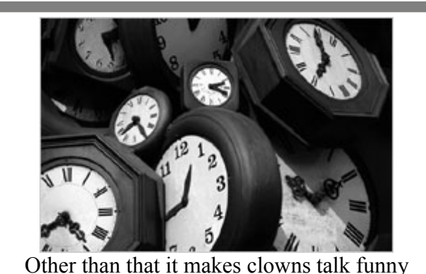
It is, moreover, very difficult to explain in any other way why there should be so much helium in the universe.

<u>1 (go back)</u> Everybody knows that the sun never sets on the continent of Atlantis. As such, the whole existence of this civilization is historically written has having happened in only one day. As such, midnight corresponds to the end of the world in Atlantis eschatology. As such, you would know as such if you had read any of my 3 theses. As such, how often can one repeat as such in the same paragraph before it losses its meaning. If it ever had any meaning as such to start with. As such.