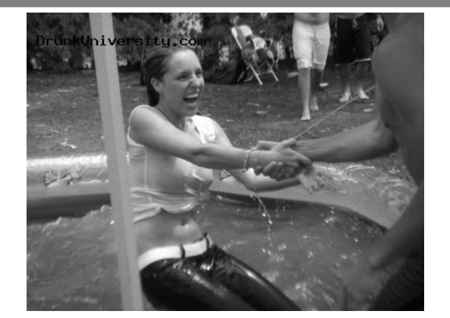
There is no Devil It's only God, uben he's drunk - Tom Waits

2 (go back) Most people are not used to the measures of four dimensions We are habituated at measuring phenomenon in a geometric three-dimensional space composed of height (axis y), width (axis x), depth (axis z). The fourth dimension is time and is measured by length which is represented along the t axis. Boring tasks that demand a significant investment of time are «long», they have a length along axis t. Interesting tasks also have a length in time but, for the sake of demonstration, I felt that comprehending how boring tasks are long in time was easy enough. The other dimension is state as will be explained to you in further details shortly if you go on reading.