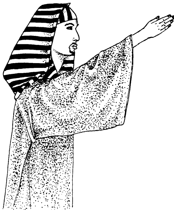
The Zelator Grade Sign

The sign of the Zelator is thus given: Stand upright and extend the right arm upwards at a forty-five degree angle, turn the hand sideways facing inward. Place your left foot forward. This position is the same gesture that the Hierophant took when he interposed for you between the Hieres and the Hegemon in the Zelator Initiation.