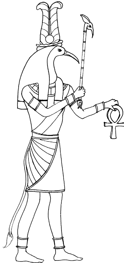
The God Form of Thoth

At the Ending of the Night: At the Limits of the Light: Tho-oth stood before the Unborn Ones of Time! Then was formulated the Universe: Then came forth the Gods thereof: The Aeons of the Bornless Beyond: Then was the Voice vibrated: Then was the Name declared. At the Threshold of the Entrance, Between the Universe and the Infinite, In the Sign of the Enterer, stood Tho-oth, As before him were the Aeons proclaimed. In Breath did he vibrate them: In symbols did he record them: For betwixt the Light and the Darkness did he stand.