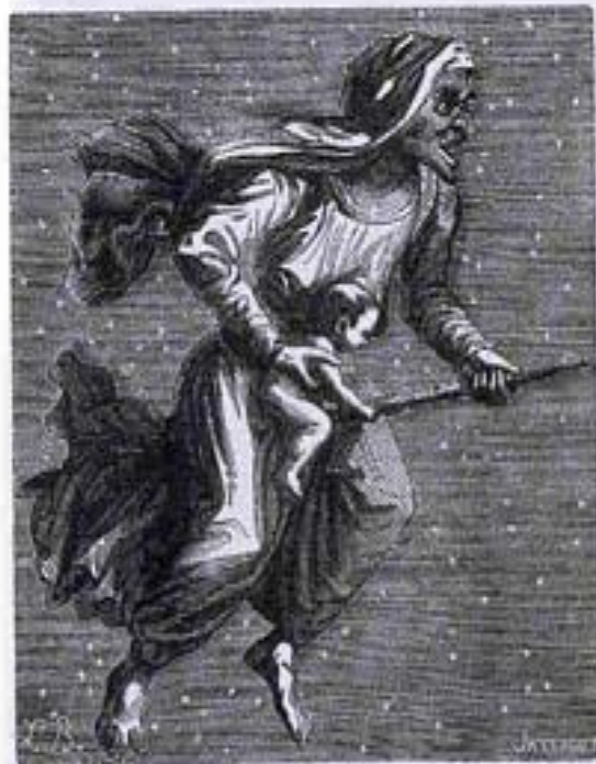
Voyages of Sorcerers