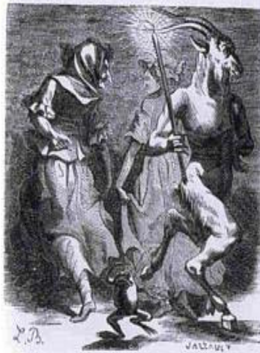
Dance of the Sabbath (27)