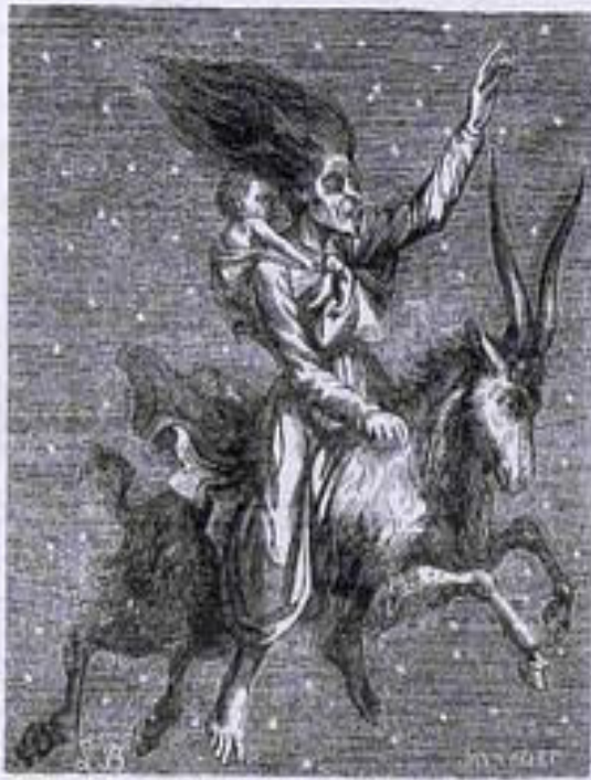
Transport of Sorcerers