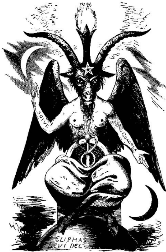
THE SABBATIC GOAT