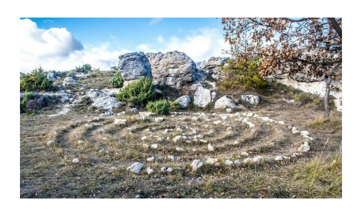
Chapter 8: Moon Magic