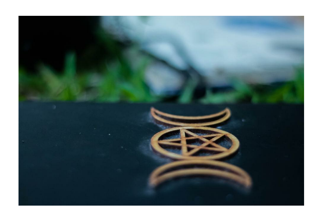
Chapter 3: The Triple Goddess