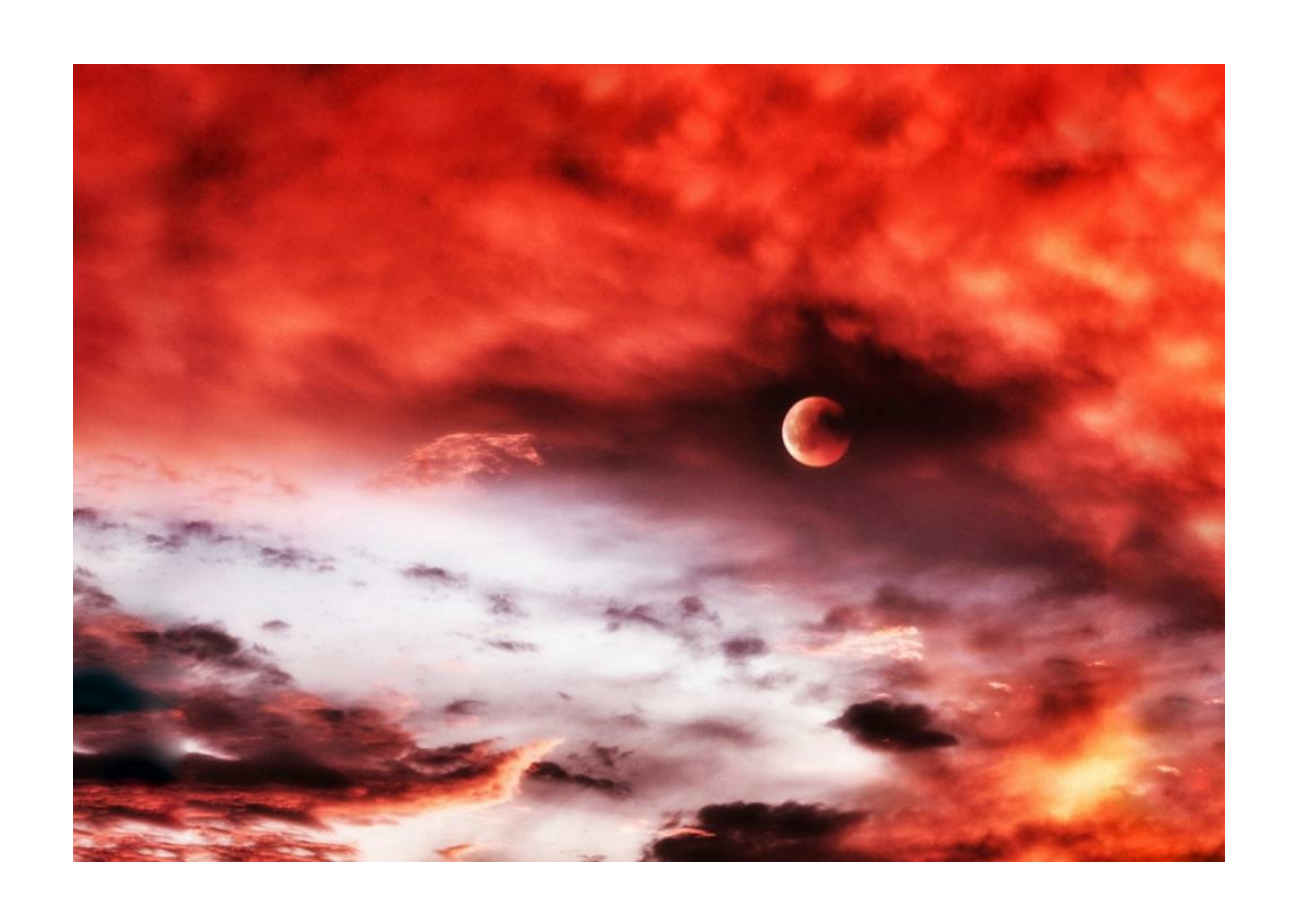
Chapter 2: The Energy of the Moon