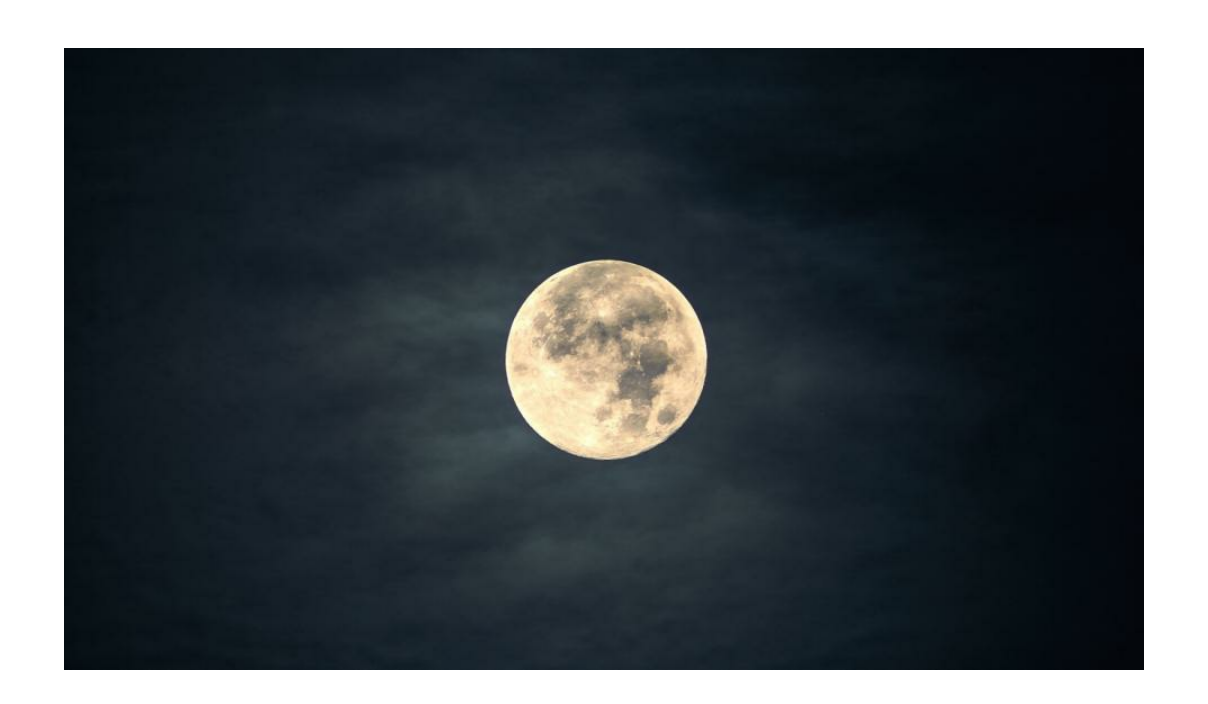
Chapter 4: Intuition and Creativity