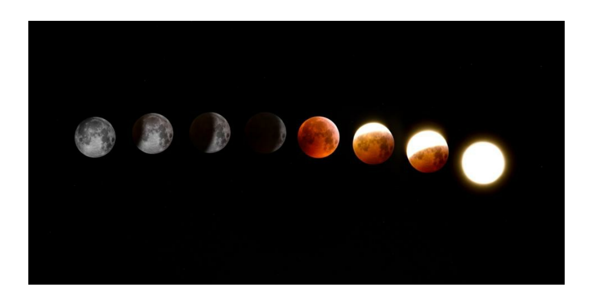
Chapter 6: The Phases of the Moon