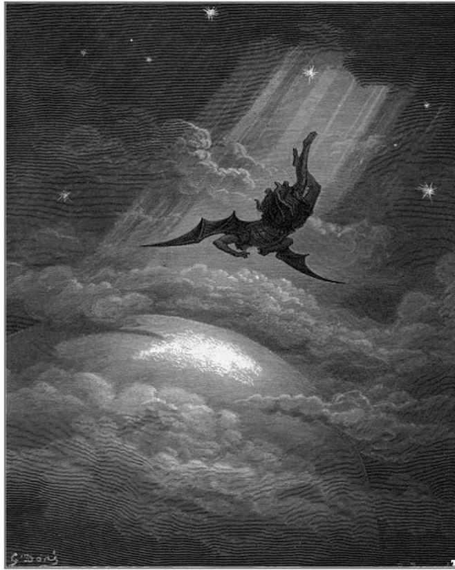
Lucifer's Fall From Grace by Gustave Doré

Lucifer comes from the Latin words Lucis (light) and Ferre (Bringer or Bearer) which translates as Light Bearer or Bringer of Light . The story of Lucifer's Fall from Grace is well known among the world. The Christian version differs from the Jewish version but we will begin with the Christian version first. The Christian story of the Fall starts in Heaven where Lucifer, after being created by God, becomes the God's favorite. Angels don't have free will so they obviously had no say or that they did not experience emotion which causes a problem with this story. Lucifer was an Angel of Light and the most beautiful angel of them all but Christians preach that Lucifer Fell from Heaven because of His Pride! I understand that Angels are divine emanations of God but if Lucifer could become victim to pride what does that say about the creator? God must have been flawed for His own emanations to react in such a un – Godly manner. There is a possibility that Angels weren't perfect as God is. It would only make sense that any emanation of God that hasn't been tampered with would be perfect as well. This analogy can also be applied to the Story of Creation which claims that God created Humans in His own image. If God was so perfect, loving and merciful then He sure fucked up when He made Man!