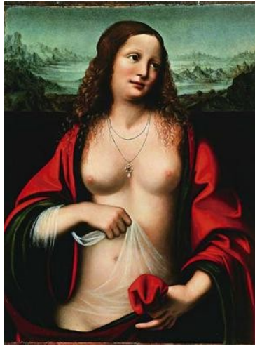
Mary Magdalene by Leonardo da Vinci

Mary Magdalene or Mary of Magdala has had a bad rap simply because She was a woman of Liberation! Mary Magdalene was not like other Women of Liberation which we associate today as Feminists. A Feminist in the truest sense is a woman or man that stands up for Women's Rights. Today when someone hears of a Feminist that automatically think that you have to be a female and that you are against all men in the belief that they are all pigs. This is not a true Feminist; this is a cult leading of Women's Liberation into Self Denial! Women's Liberation is really about Women's Liberation and there is no room for a man in the Liberation of a Woman because only a woman can liberate themselves as can only a man liberates themselves. Mary Magdalene is venerated not only as a Saint within the Esoteric Gnostic Catholic Church but also as a Divine Master!