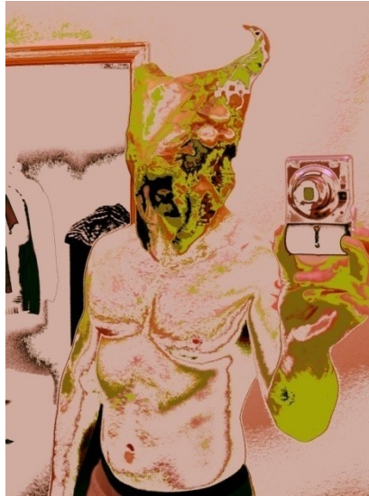
Venger Satanis -