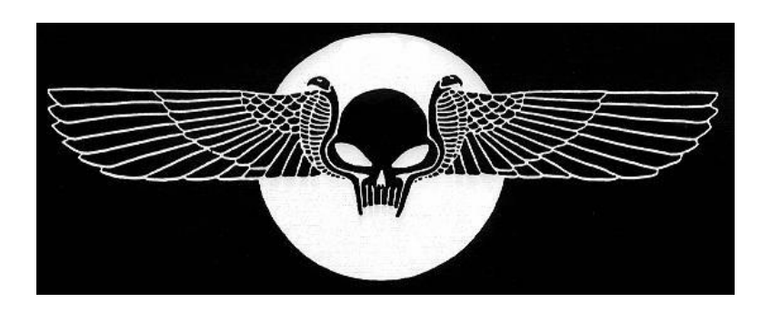
Thus concludes The Vampire Bible