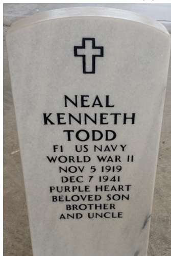
UPRIGHT HEADSTONE WHITE MARBLE (U) OR LIGHT GRAY GRANITE (V)

This headstone is 42 inches long, 13 inches wide and 4 inches thick. Weight is approximately 230 pounds. Variations may occur in stone color, and the marble may contain light to moderate veining. Additional inscription is limited to 15 characters (including spaces) up to four lines maximum.