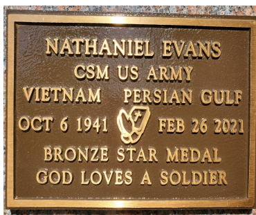
BRONZE NICHE (Z)

This niche marker is 8-1/2 inches long, 5-1/2 inches wide, with 7/16 inch rise. Weight is approximately 3 pounds; mounting bolts and washers are furnished with the marker. Used for columbarium or mausoleum interment. Also provided to supplement a privately-purchased, permanent and durable headstone or marker for eligible Veterans who died on or after November 1, 1990 and are buried in a private cemetery. Additional inscription is limited to 27 characters (including spaces) up to two lines maximum.