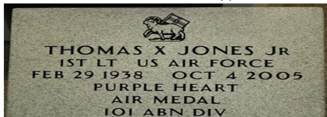
SMALL FLAT GRANITE (L)

This grave marker is 18 inches long, 12 inches wide, and 3 inches thick. Weight is approximately 70 pounds. Variations may occur in stone color. Additional inscription is limited to 27 characters (including spaces) up to two lines maximum.