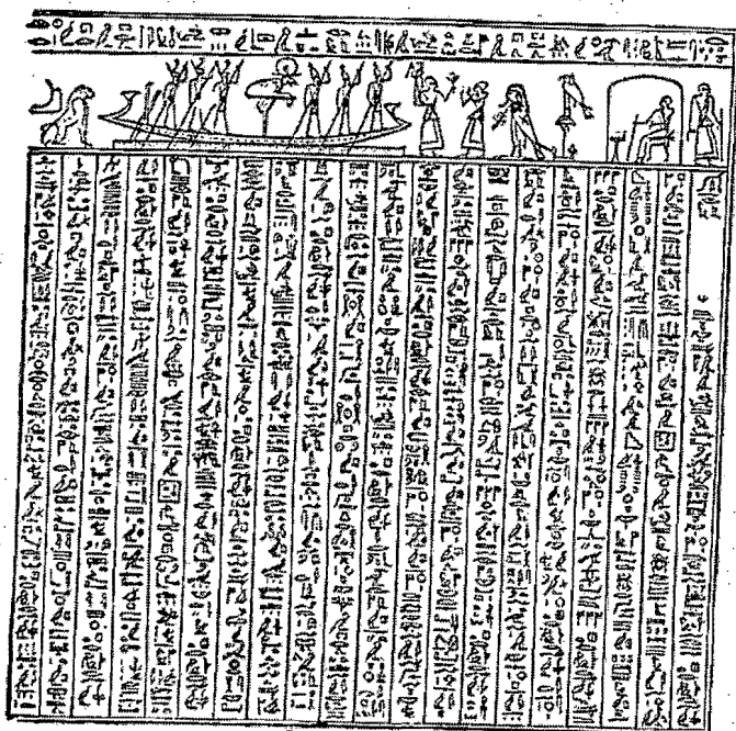
172. Page from an Egyptian papyrus book of the Dead, which was placed into the tomb, with the mummies as a guide for the souls of the departed.