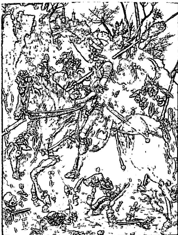
"Knight, Death and Devil." Engraving by Albrecht Dürer, Nuremberg, 1513.