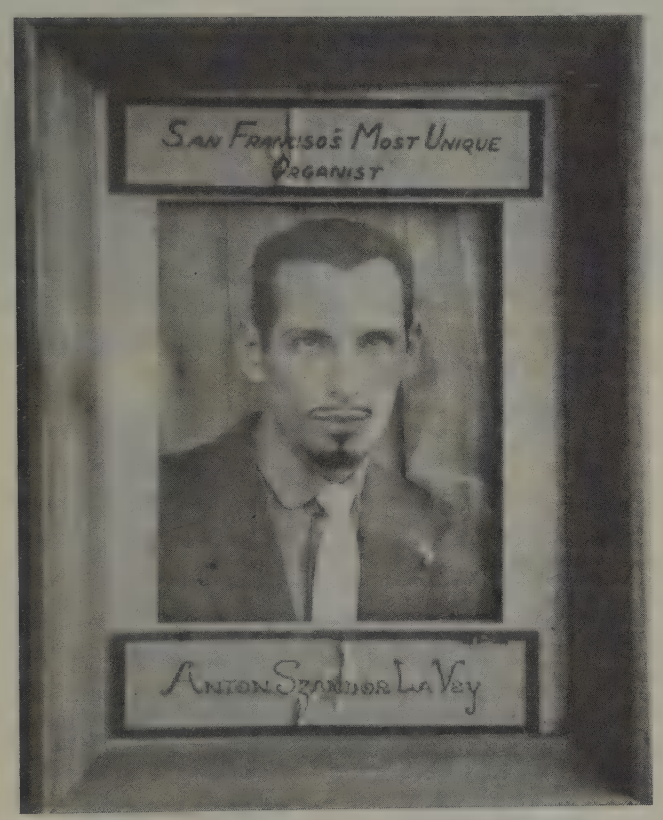
FIGURE 6 Anton LaVey as a San Francisco organist, taken sometime in the late 1950s during his night club organist period.