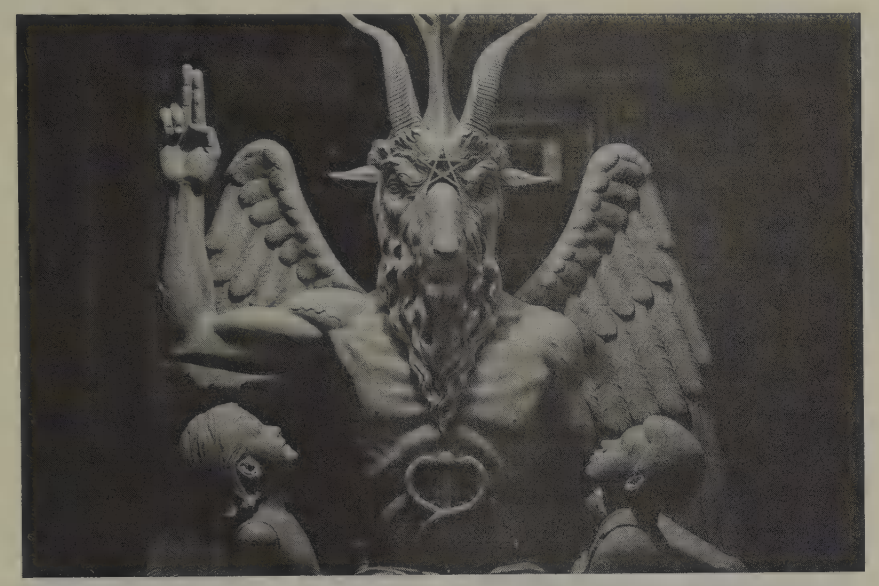
FIGURE I Statue of Satan in the form of Baphomet attended by two admiring children. A bronze monument of this statue is to be erected next to the Ten Commandments statue that was installed in front of the Oklahoma statehouse.