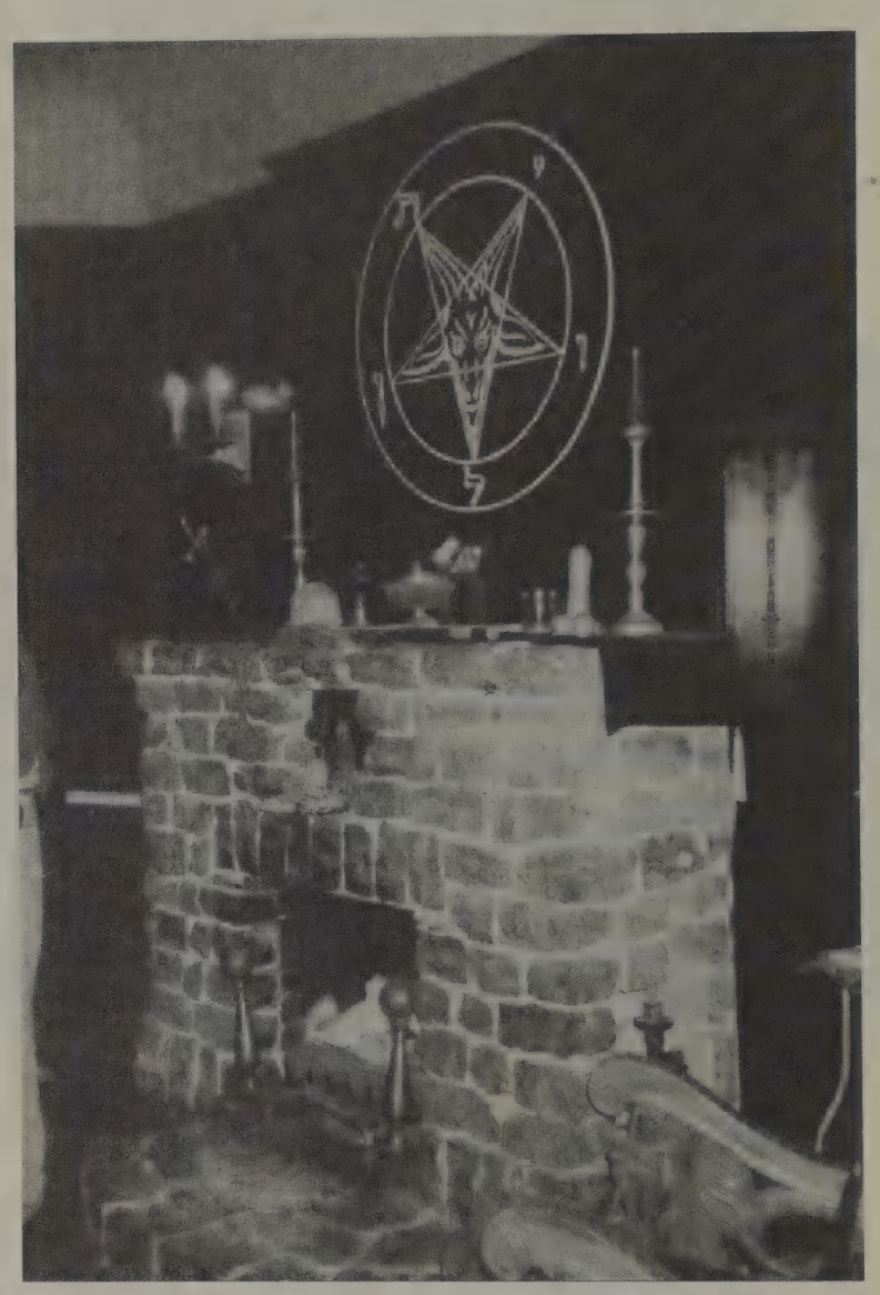
FIGURE 5 The Church of Satan's Retired Ritual Chamber at LaVey's home. This photo was taken in 1991 during the dissolution settlement between Anton LaVey and Diane Hegarty. By then, the infamous ritual chamber had not been used for over a decade.