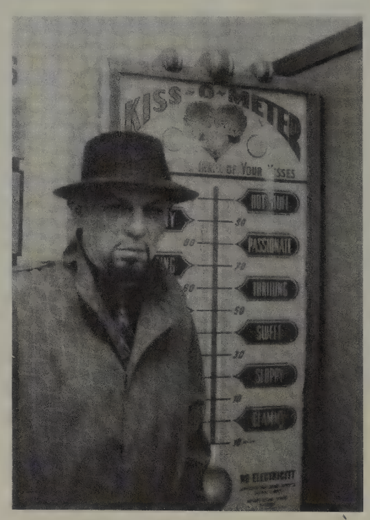
FIGURE 8 Anton LaVey identified with the circus and claimed to have been a carnival organist. This image is part of the photo shoot in 1987 Arthur Lyons's book, Satan Wants You .