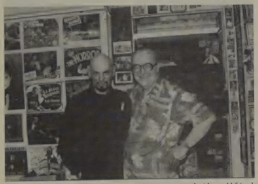
FIGURE 2 While visiting Los Angeles in 1988, LaVey reunited with an old friend, Forrest Ackermann, after a decades' long hiatus in communication.

FIGURE I Statue of Satan in the form of Baphomet attended by two admiring children. A bronze monument of this statue is to be erected next to the Ten Commandments statue that was installed in front of the Oklahoma statehouse.