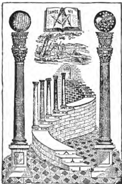
FELLOW CRAFT CHART