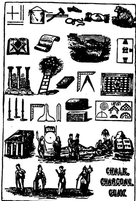
ENTERED APPRENTICE CHART