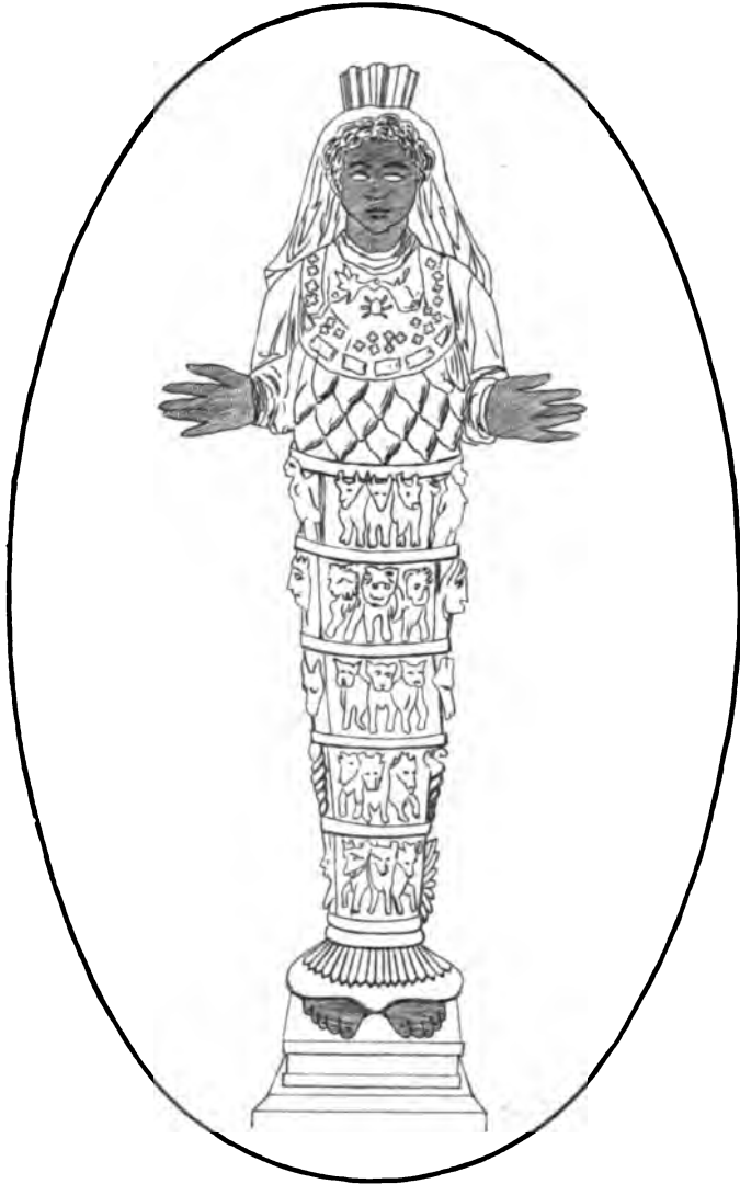
NATURE VIRGIN OF THE WORLD. OR ROSALIND.