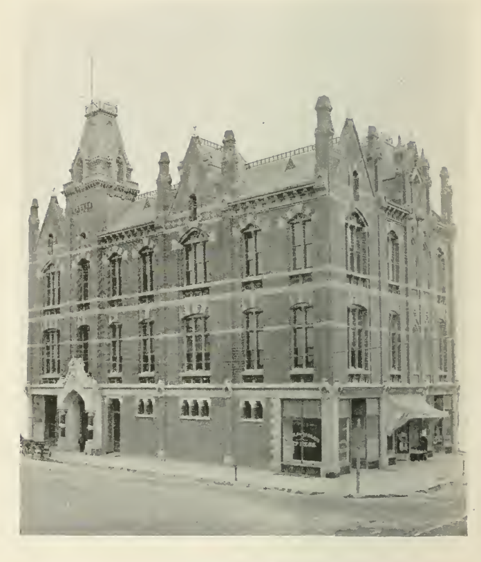
MASONIC TEMPLE. Home of Live Oak Lodge, No. 61. Dedicated Feb. 22, 1881.