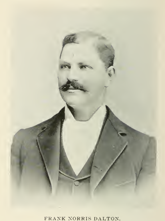
Born in Pacheco, Contra Costa Co., Cal., March 25, 1863, M. M. Live Oak Lodge, Oct. 16, 1885. Was W. M. in 1892.