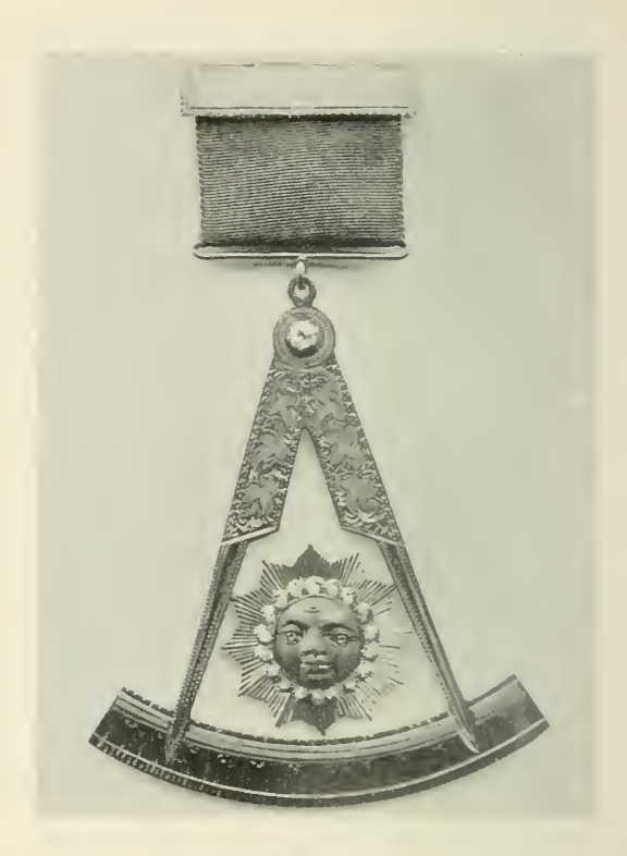
Past Master's Jewel. Live Oak Lodge, No. 61