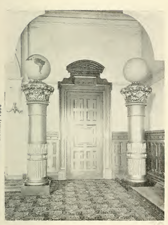
Brazen Pillars, Hall of Live Oak Lodge.