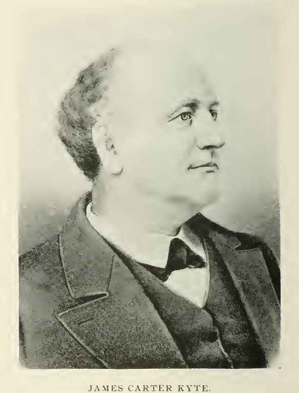
Born in Geneva, Ontario Co., New York, Sept. 29, 1833, M. M. Live Oak Lodge, Nov. 3, 1859, Was W. M. in 1869-70.