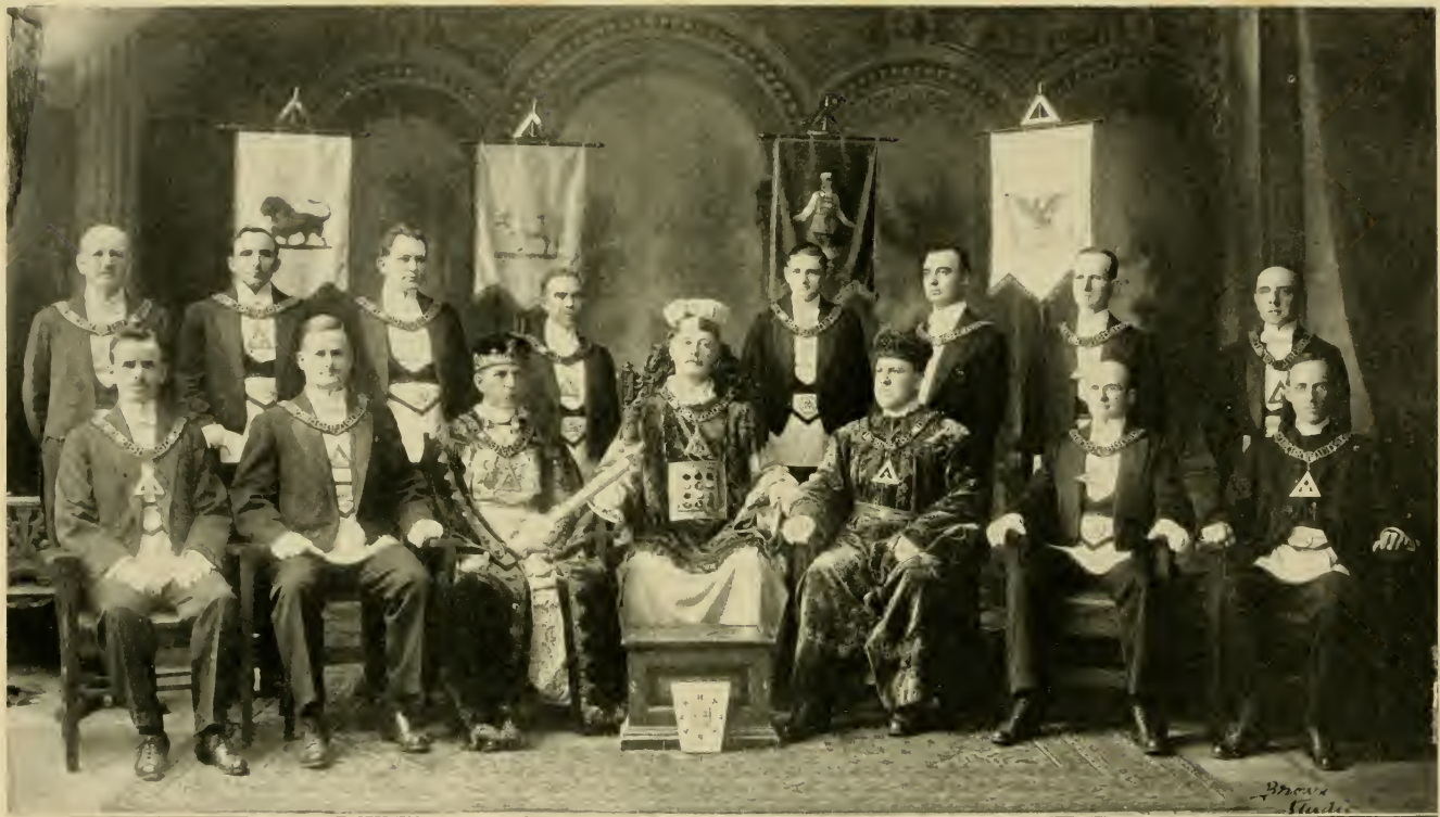
OFFICERS OF ADONIRAM ROYAL ARCH CHAPTER 1916