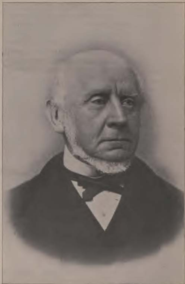
CHARLES FRANCIS ADAMS.