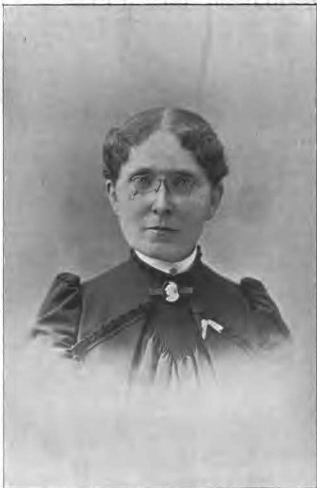
FRANCES E. WILLARD.