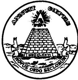
The reverse side of the Great Seal of the United States, showing the Illuminati Eye, and the pyramid or triangle, as on the back of a one-dollar note.