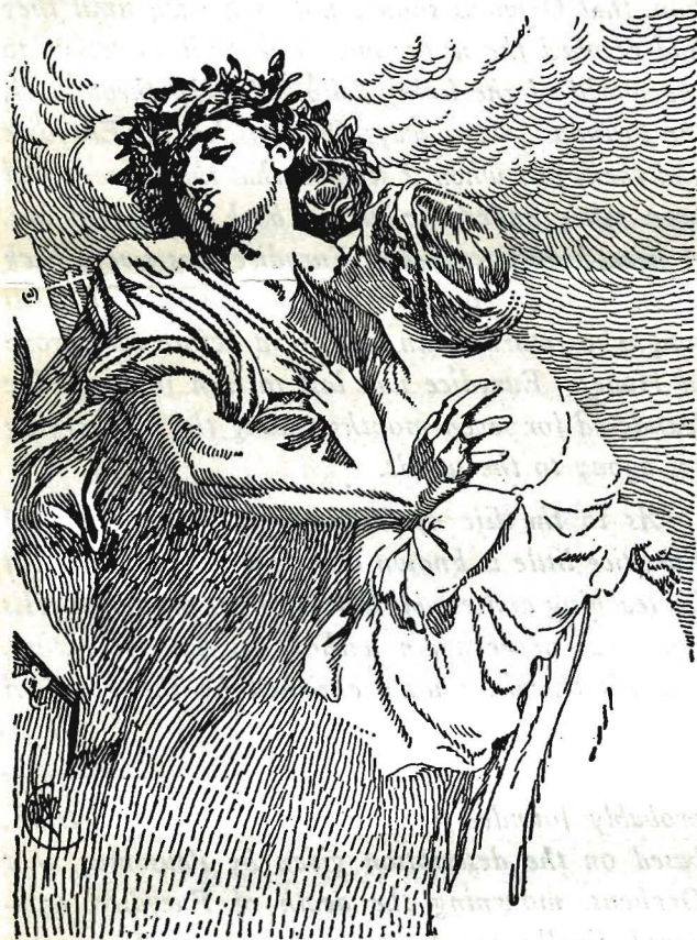
ORPHEUS AND EURYDICE

spell. The trees stilled the rustle of their leaves, the birds gathered silently on over-shadowing boughs while animals came from their lairs, and even the fish in the pools gathered close to the verdant banks listening to the magic of his song. Thus it came about that Orpheus received the title of The Sweet Singer , and it was reported of him