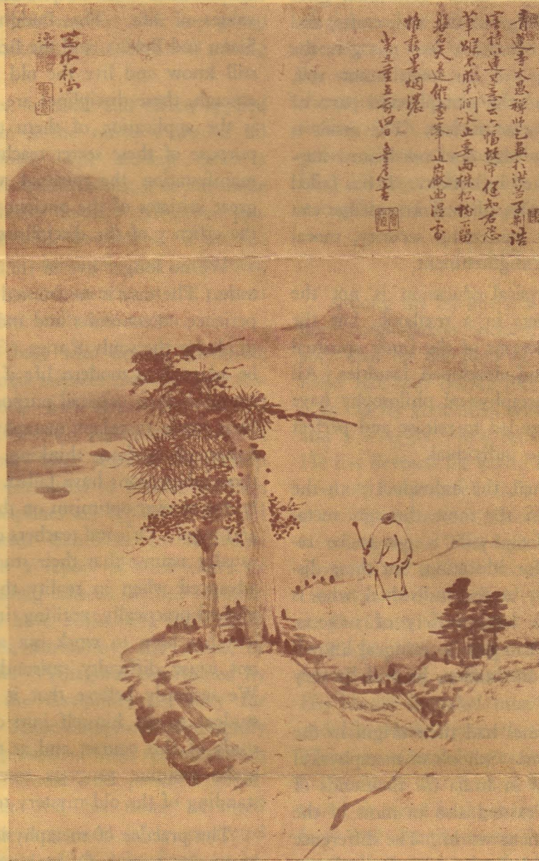
(Chinese painting showing a strong Zen influence. In the author's collection.)

feels, how broadly he studies and improves himself outwardly, he is not complete until he has perfected his inner disposition. Until spiritual consciousness has tintured and brought to perfec-