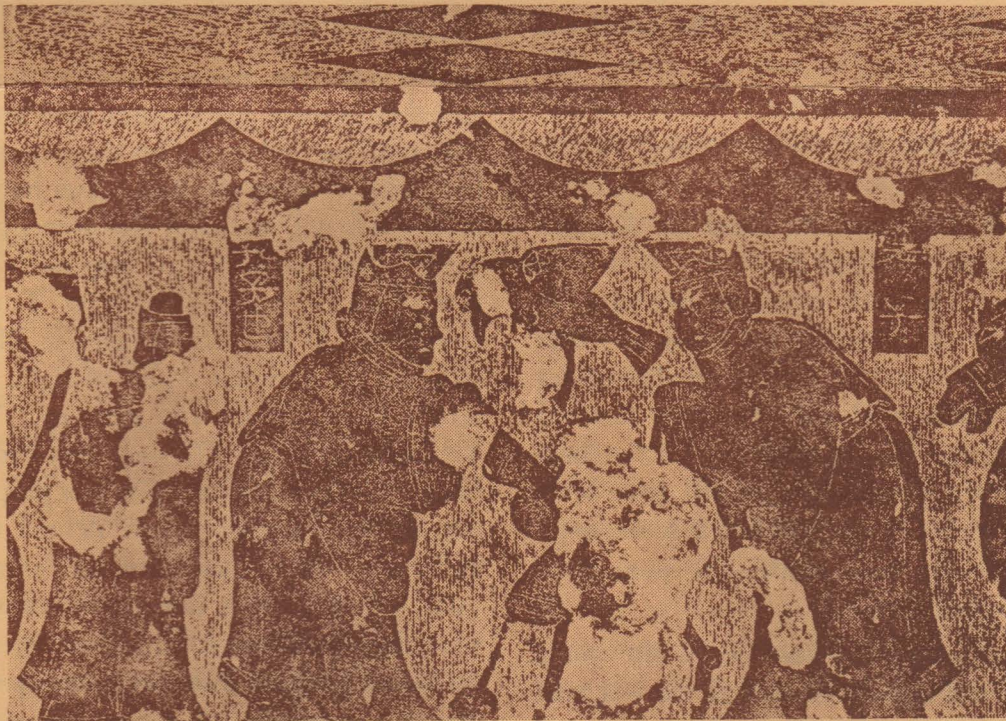
A STONE RELIEF CARVING FROM THE HAN DYNASTY DEPICTING THE MEETING OF CONFUCIUS AND LAO-TZE. This fine old stone rubbing shows the two immortals of Ching exchanging the formalities of greeting at the entrance to the library of the Chou. The artistic treatment though apparently crude is regarded as one of the finest periods in Chinese primitive design.

Modern psychology has invented the term mystical experience to explain the mystery of illumination. Havelock Ellis, in summarizing the effect