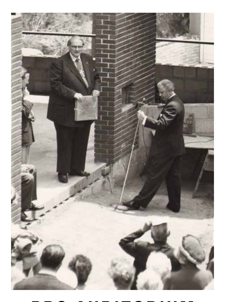
PRS AUDITORIUM DEDICATION CEREMONY MAY 16, 1959