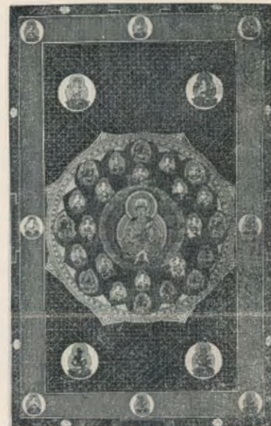
No. 3. Eye of Buddha Mandara.

Those visiting the headquarters of the Society have often expressed a desire to purchase copies of Mandala paintings in our collection. These sacred designs are difficult to find even in the Orient, and the few reproductions that are available are in expensive volumes on Eastern art. We have therefore decided to reproduce four of these pictures in full color, suitable for framing and study. The small reproductions on this page are simply for purposes of identification. They give no concept of the loveliness of the full size prints.