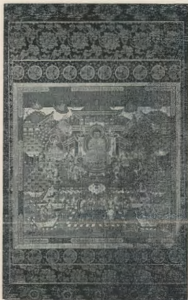
No. 1. Taima Mandara.