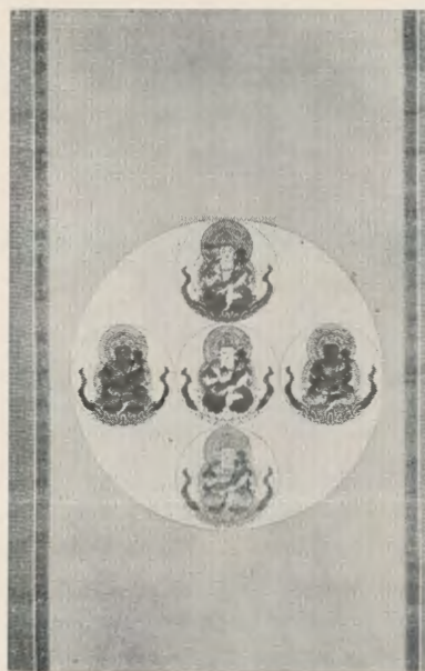
No. 2. Kokuzo Mandara.