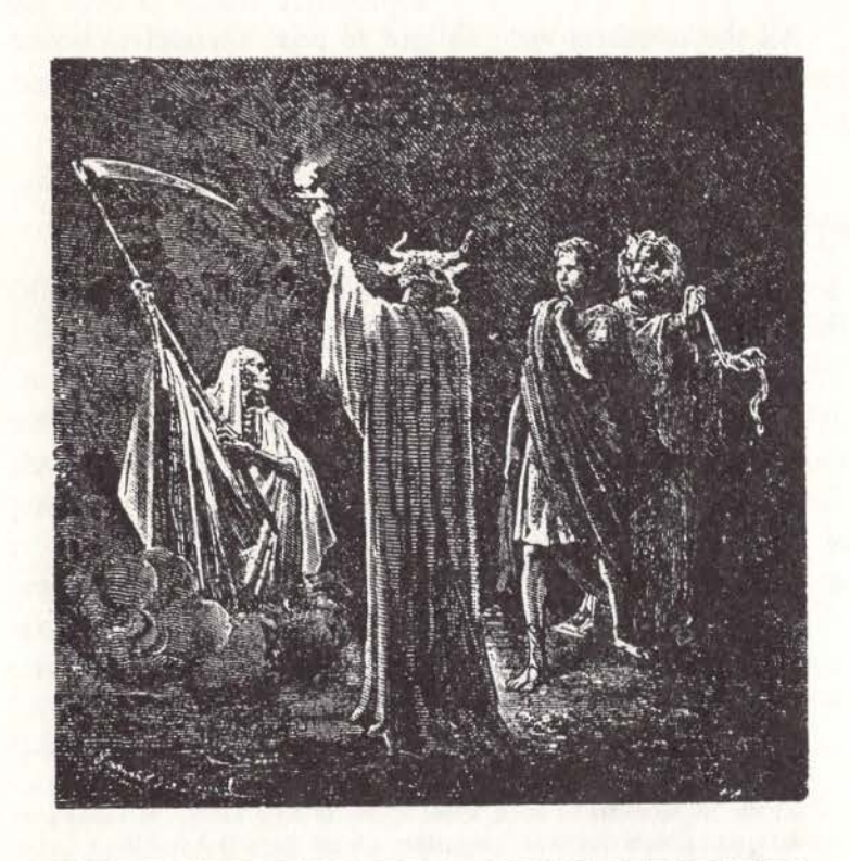
SPECTRAL FORMS APPROACH THE NEOPHYTE (FROM CHRISTIAN'S HISTOIRE DE LA MAGIE)