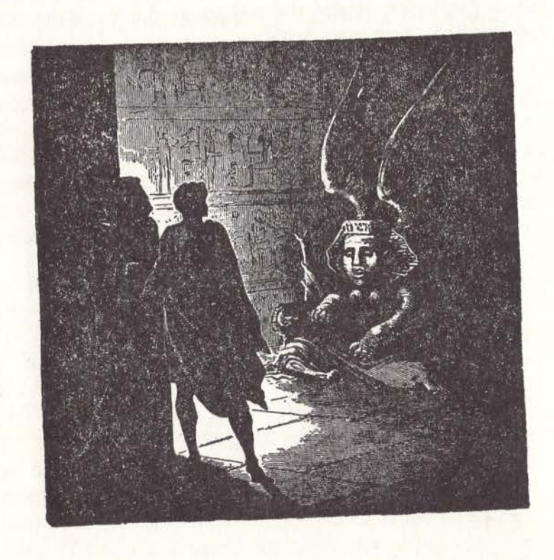
A SCENE FROM THE DRAMA OF INITIATION (FROM CHRISTIAN'S HISTOIRE DE LA MAGIE)