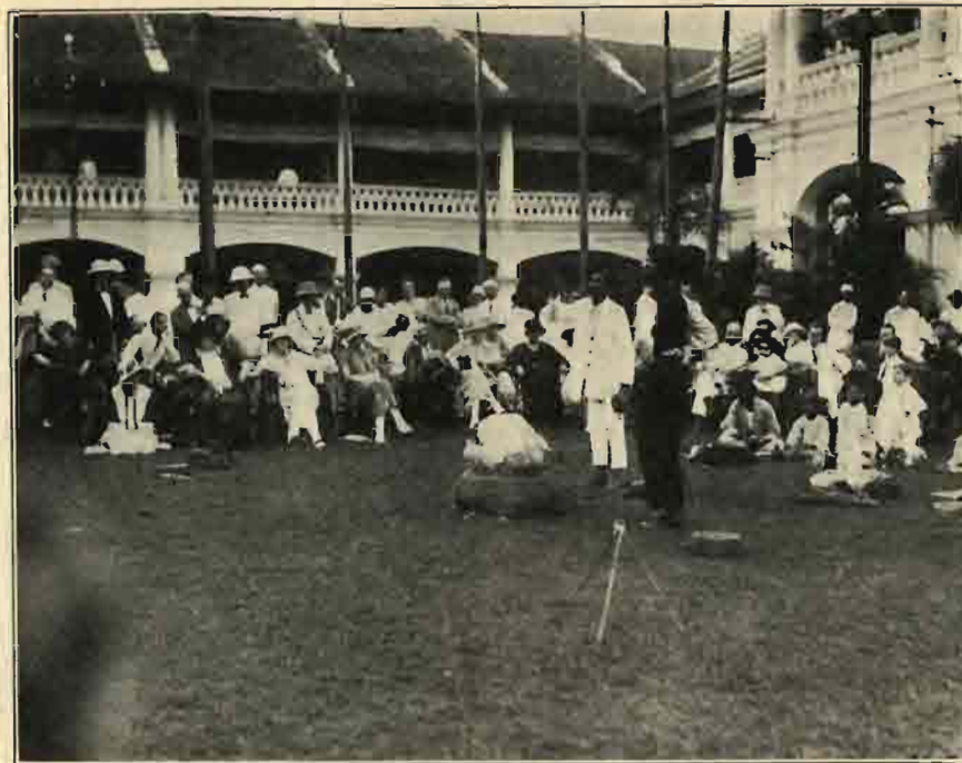
The Boy in the Basket Trick

In the grounds of the Raffles Hotel in Singapore we saw one of the finest demonstrations of Oriental magic. We made a desperate effort to photograph the various tricks, but the failing light—for magicians prefer to work in the