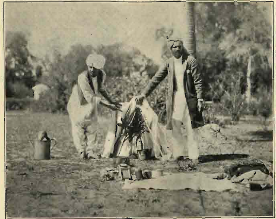
Growing the Mango Tree

The young man told me that upon one occasion he retired into the foothills of the Himalayas for a two-year period of meditation and renunciation.