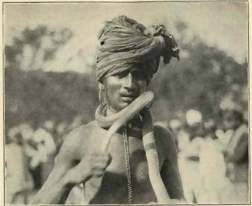
A Hindu Snake Charmer

While wandering in the grounds of the Victoria Memorial building we met the interesting personage whose photograph accompanies this article. When first seen, he was sitting down, surrounded by his snakes and a troupe of small boys, the latter as irrepressible in India as in America. Noting the approach of a white man, which meant money, the Hindu prepared his performance. Motioning the boys to keep back, he stood up, his skin gleaming like copper in the humid Indian sunlight. His clothing consisted of a varicolored turban and a rag about his loins. He motioned to a young Mohammedan who stood nearby to loan him his slipper, and the youth with a laugh