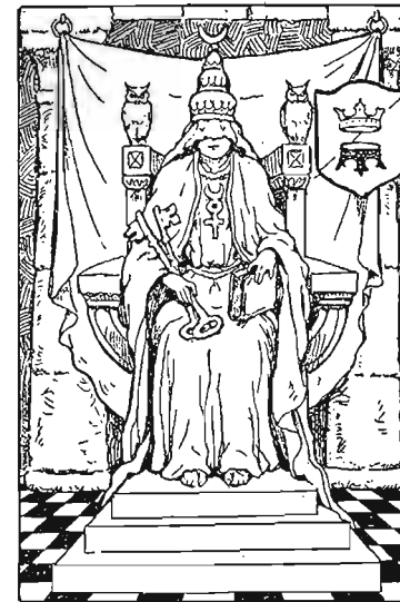
2 LA PAPESSE

Socrates was a philosopher of the streets who believed that by analyzing the chemistry of human relationships he could discover the solution to the riddle of life. His temple was the Forum, his school the market-place, and the subject and object of his every conclusion—Man.