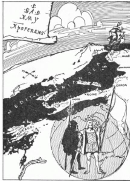
The cipher signature of Columbus (reproduced above) is generally interpreted Salve Christus, Maria, Yosephus-Christoferens . It was usual to build personal ciphers upon dates. If the seven large letters above the signature are read according to the medieval system of numeration the date 1420 results. The "x" appears to be a double letter composed of "jx"; this would increase the sum to 1430. Is this then the true and unknown birthdate of the Greek navigator?

NOTE: The University of Barcelona has pronounced genuine a document discovered by an Italian archeologist in 1929. It records that the treasurer of Spain counseled Colon to represent himself as Christophorens in demanding aid from the King of Spain, and states emphatically that Admiral Colon was not the same man as Christophoro Colombo, son of Dominico and Susana Fontanarossa who lived in Genoa.