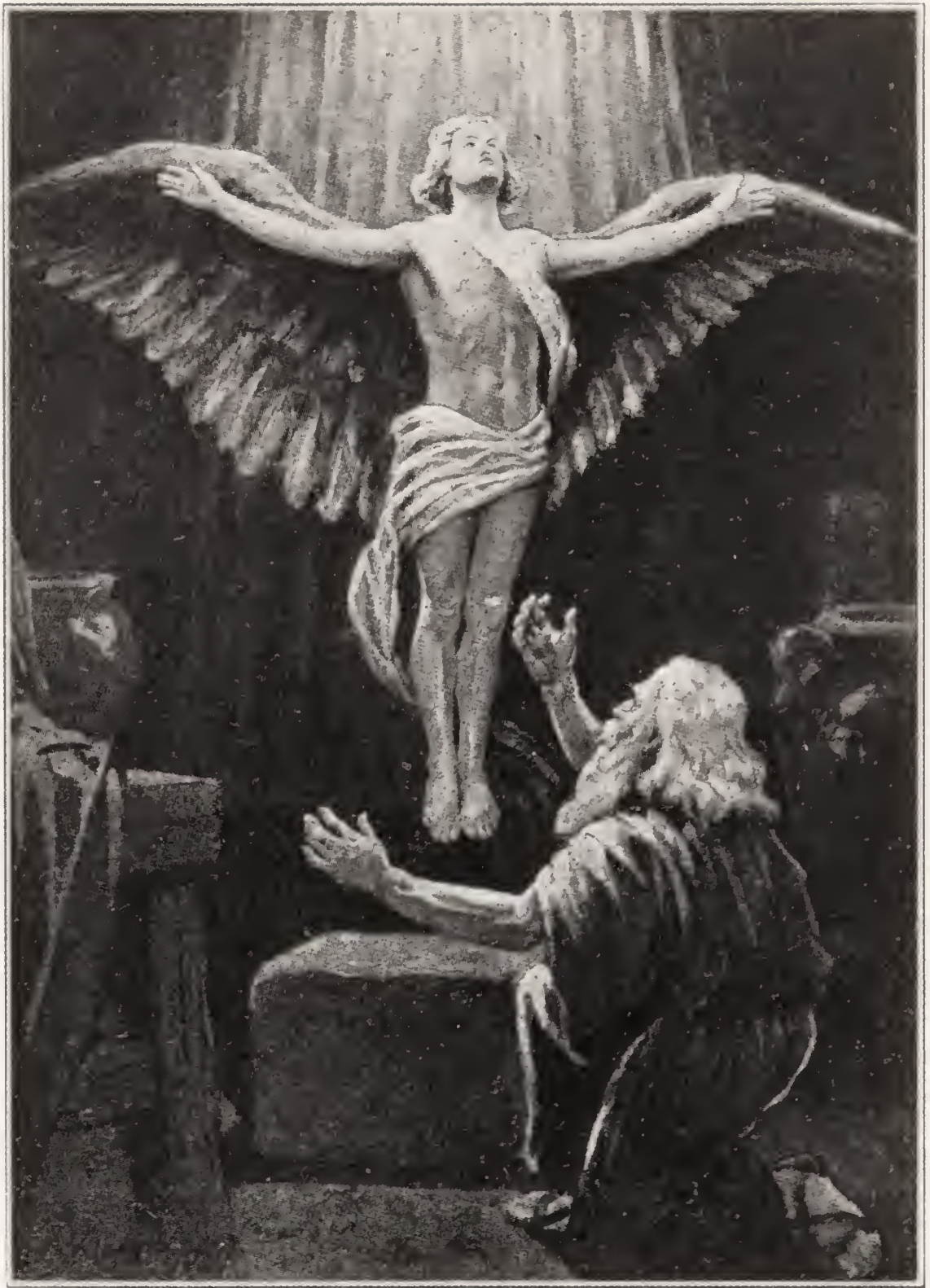
With a spring upward and a spreading of its mighty pinions, the new-born God soared heavenward to the heart of the Great Light, a wondrous flutter of crimson robes.