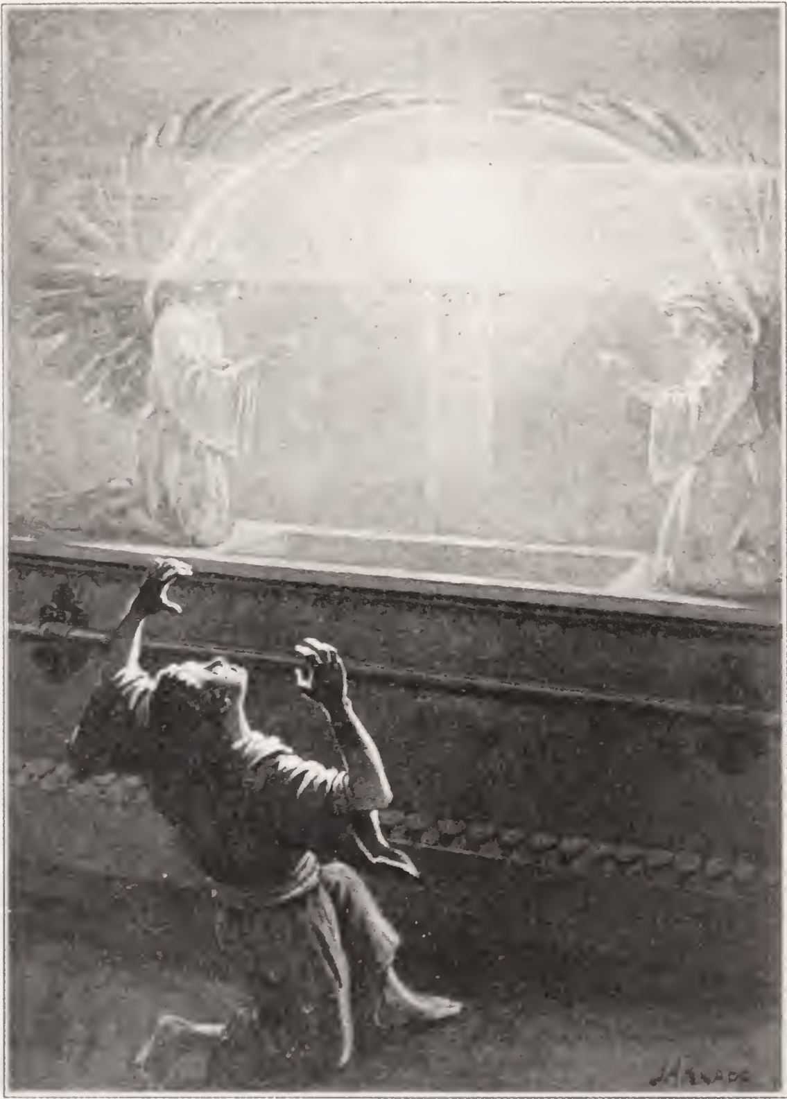
A buzzing, droning hum seemed to beat upon the air as Jehovah descended and hung as a gleaming globe of fire between the wings of the Cherubim.