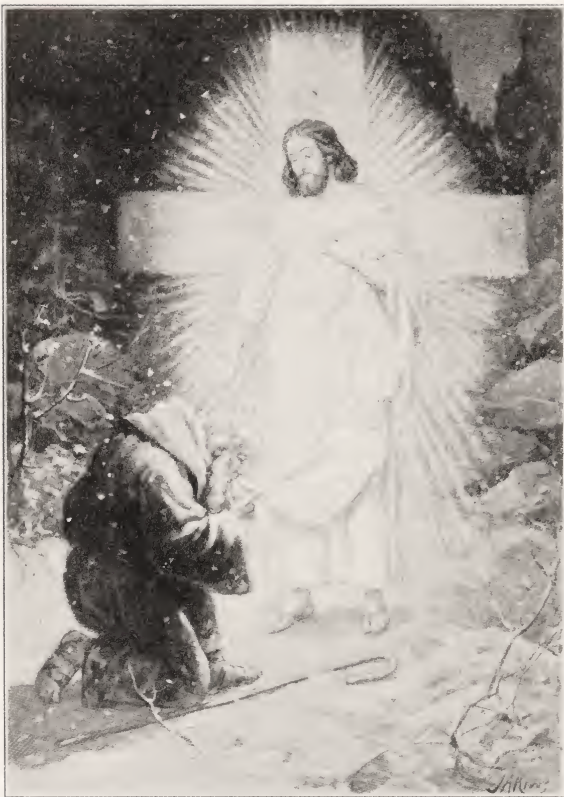
Heeding not the rough stones, he fell on his knee amidst the drifting snow and, clasping the hem of the Christ's garment, reverently kissed it.