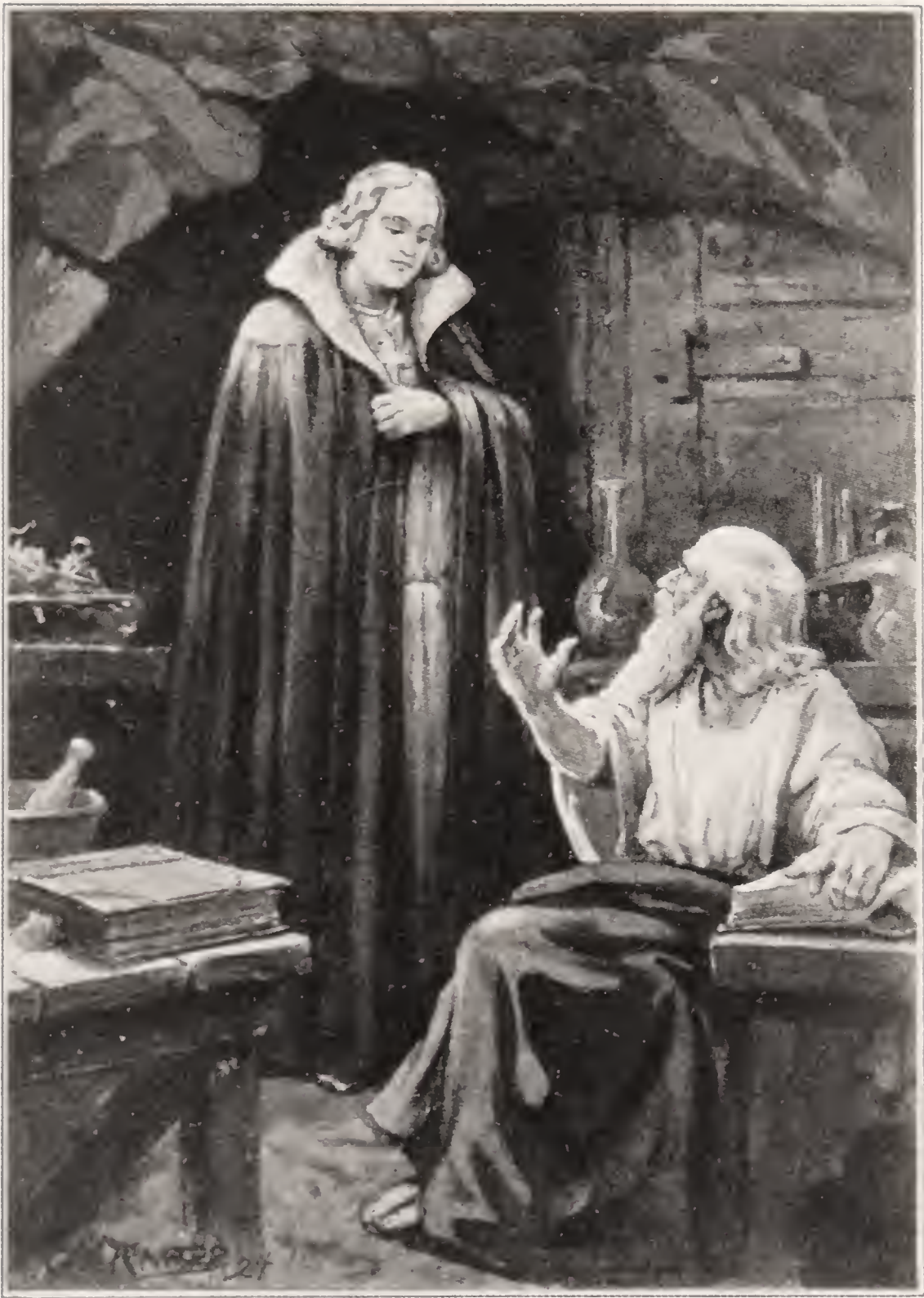
A tall, slender man, with dark eyes and a broad, noble forehead, stood behind him, draped from head to foot in a flowing cape of indigo blue.