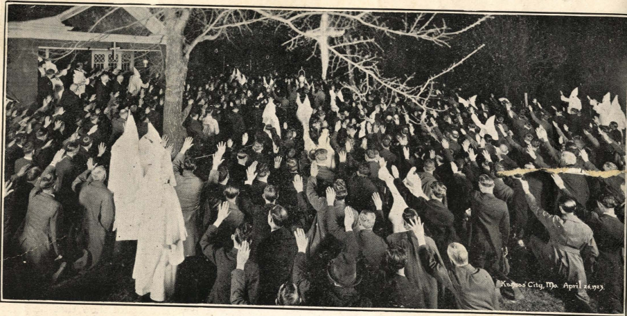
Kansas City, Mo. April 26, 1923

THE Klans in Kansas City, Missouri, are numbered among the most active organizations in the United States and their growth is steady. A number of open air ceremonials at which thousands of new members are